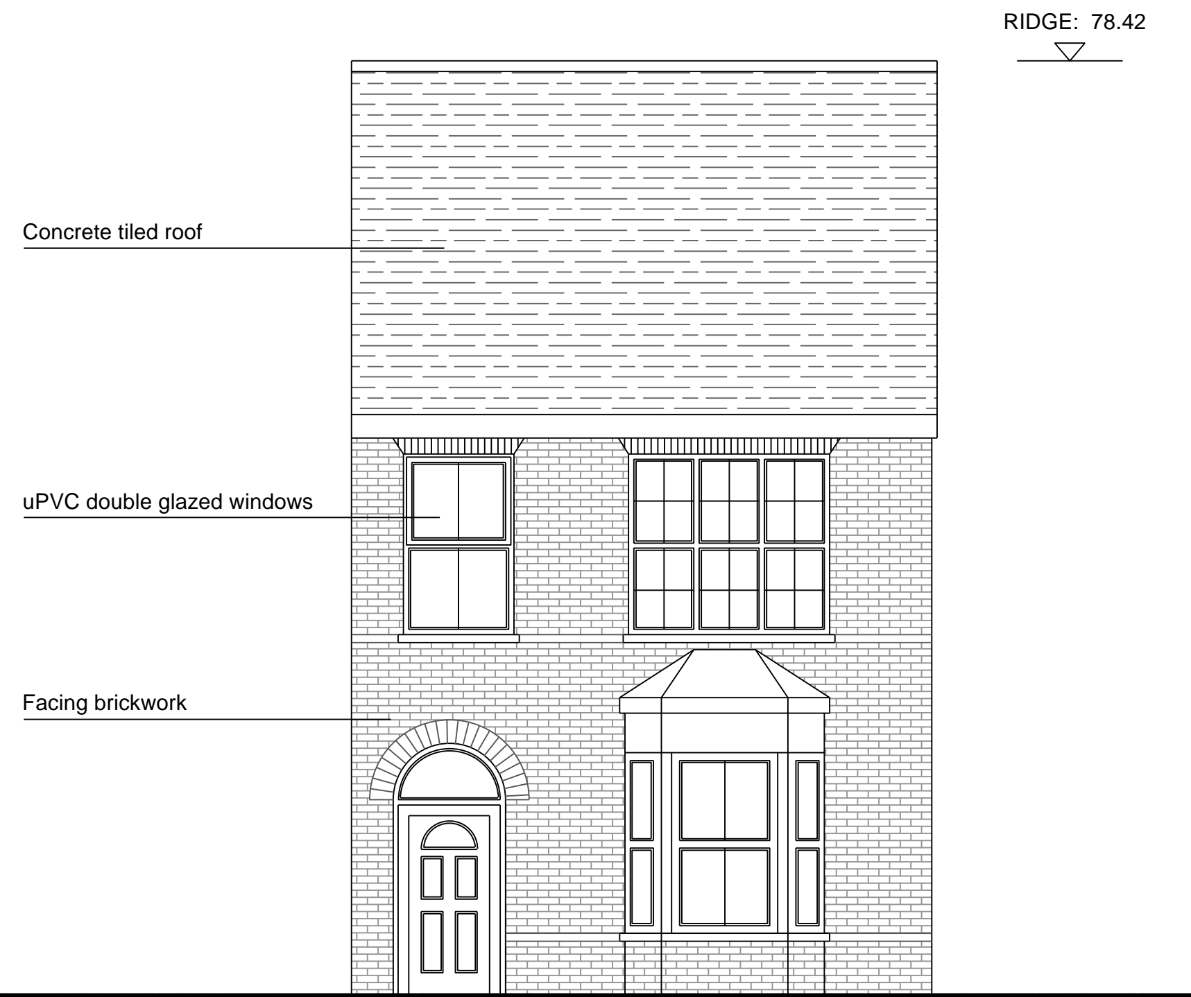
ELEVATION A EXISTING FRONT ELEVATION