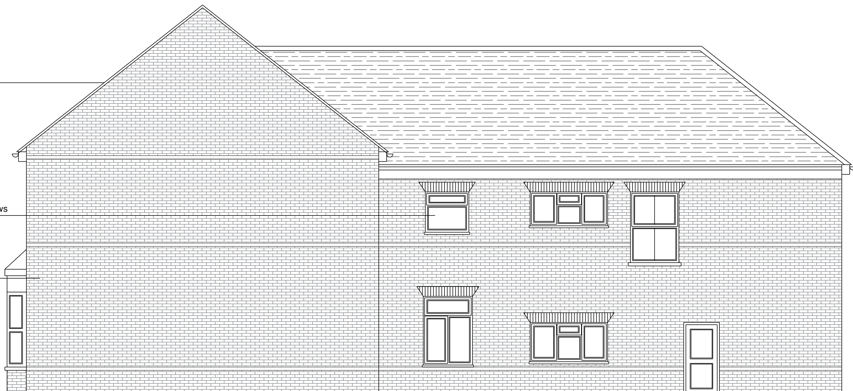
ELEVATION D PROPOSED SIDE ELEVATION