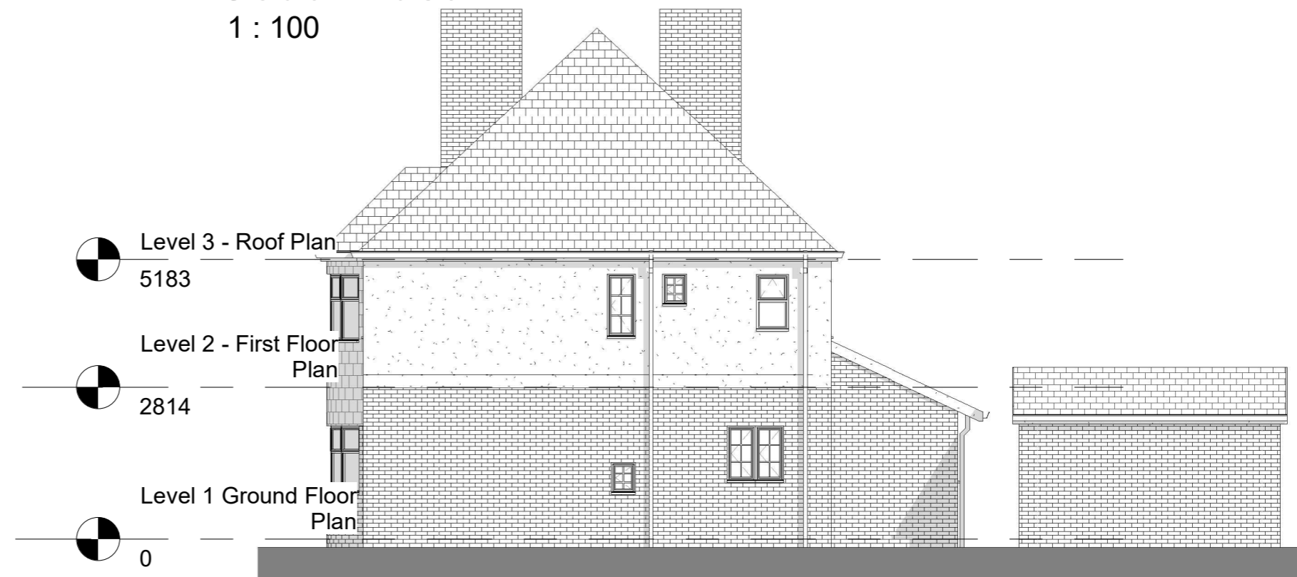
North West 1 : 100