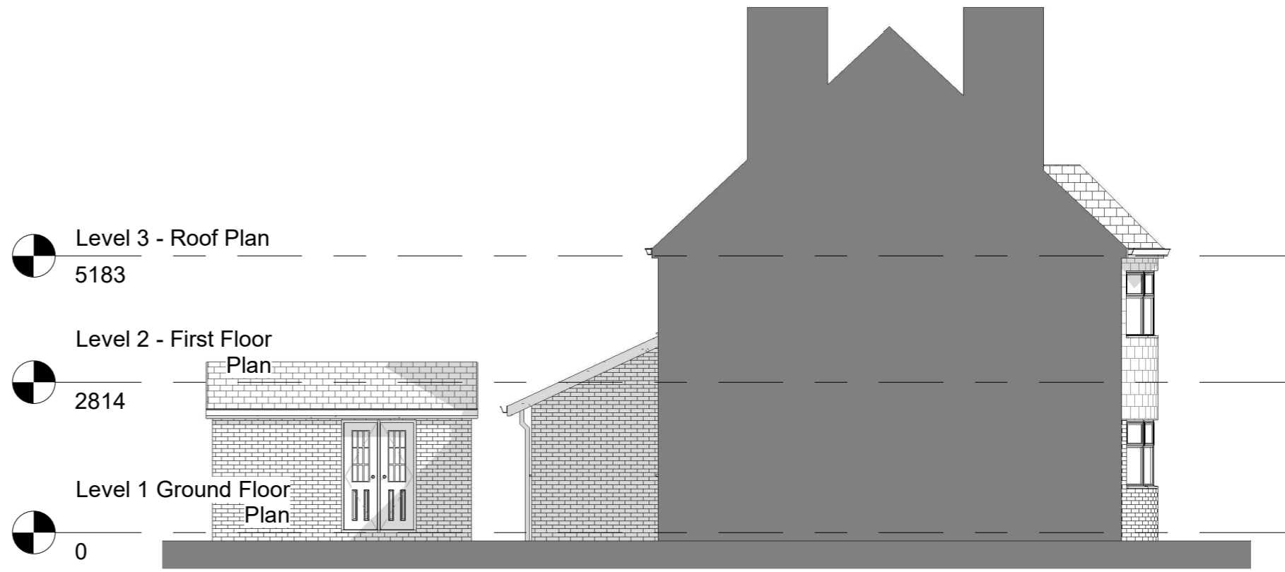
South East 1 : 100