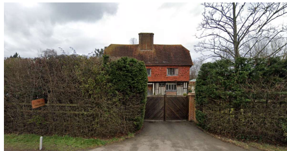
Listed Building 'The Glass House'