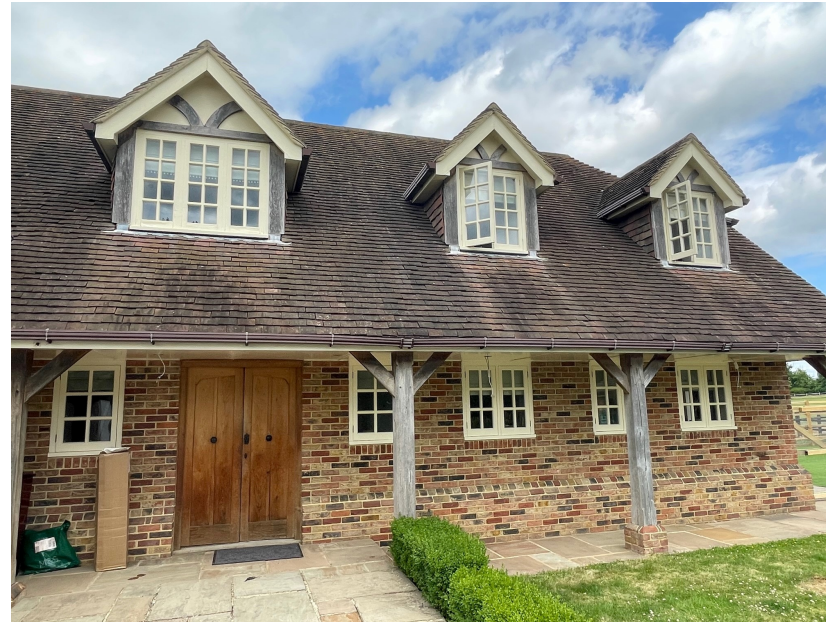
'Lawton Place' Benover Road Yalding Kent. ME18 6AU