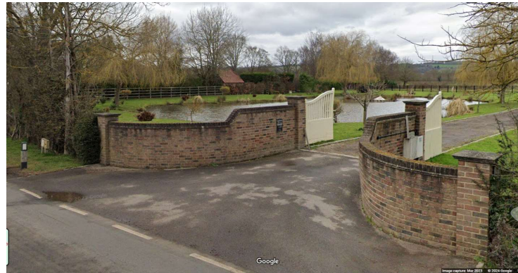
Boundary between Lawton Place & Glass House

The boundary between 'The Glass House' and Lawton Place is a mature, high hedgerow with numerous mature trees. This provides adequate privacy between the two properties. As shown below.