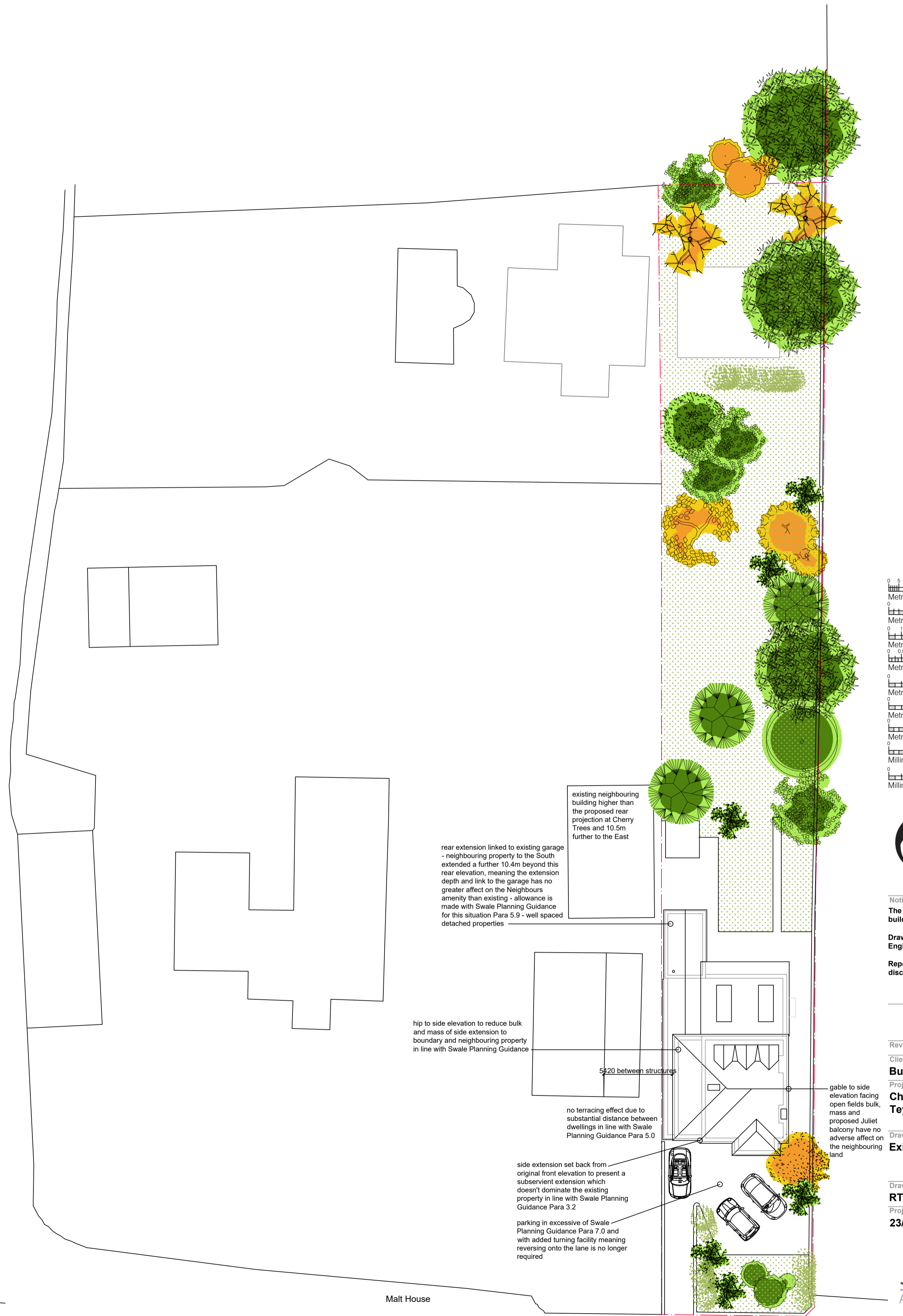
02 Proposed Block Plan Scale 1:200