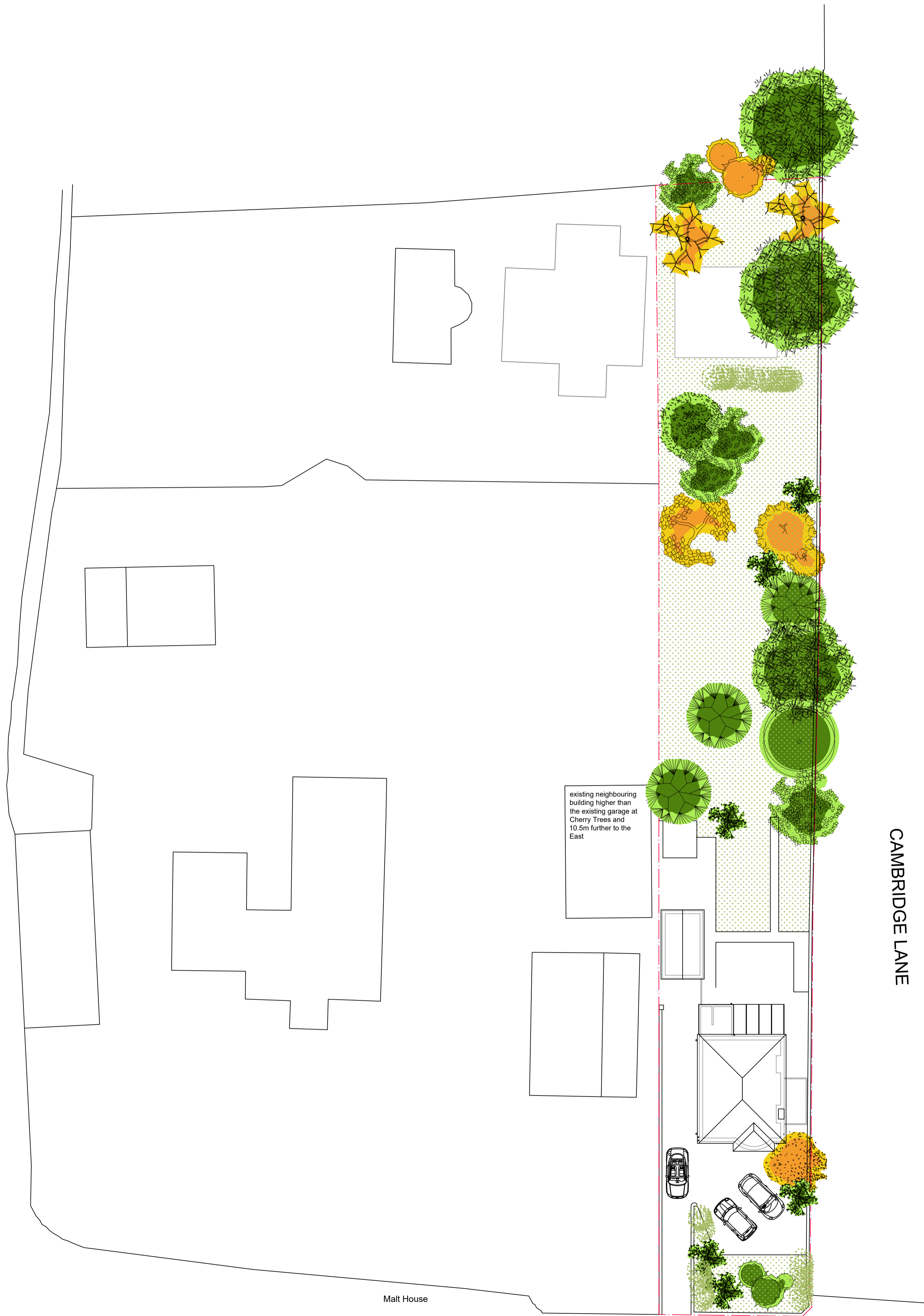
01 Existing Block Plan Scale 1:200