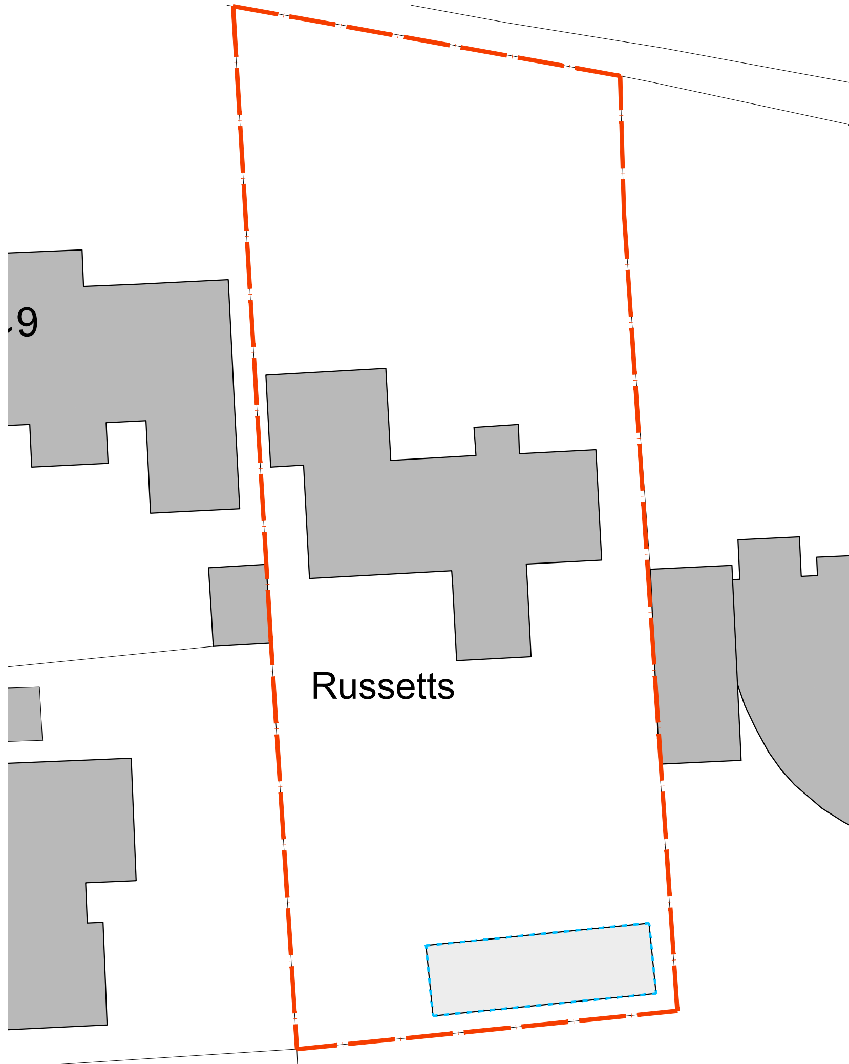
SITE BLOCK PLAN 1:200