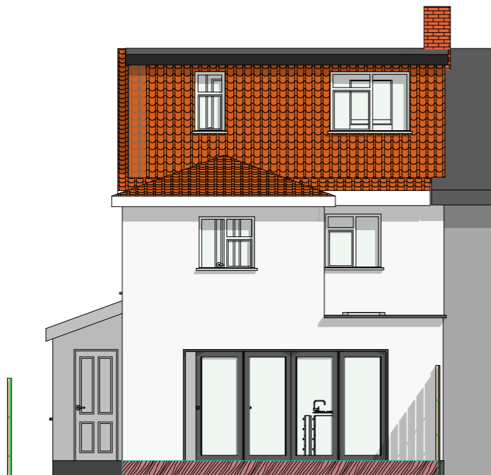
WEST REAR ELEVATION 1:100