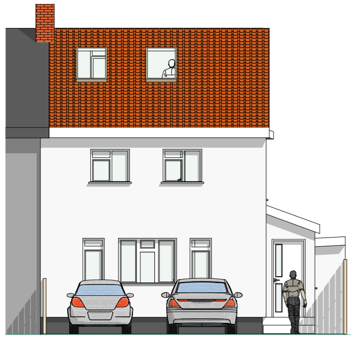
FRONT ELEVATION EAST 1:100