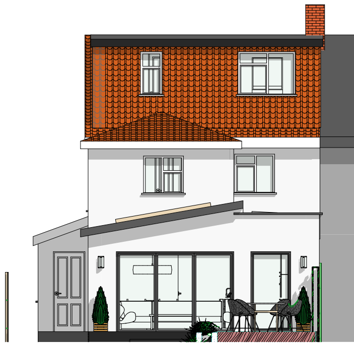
WEST REAR ELEVATION 1:100