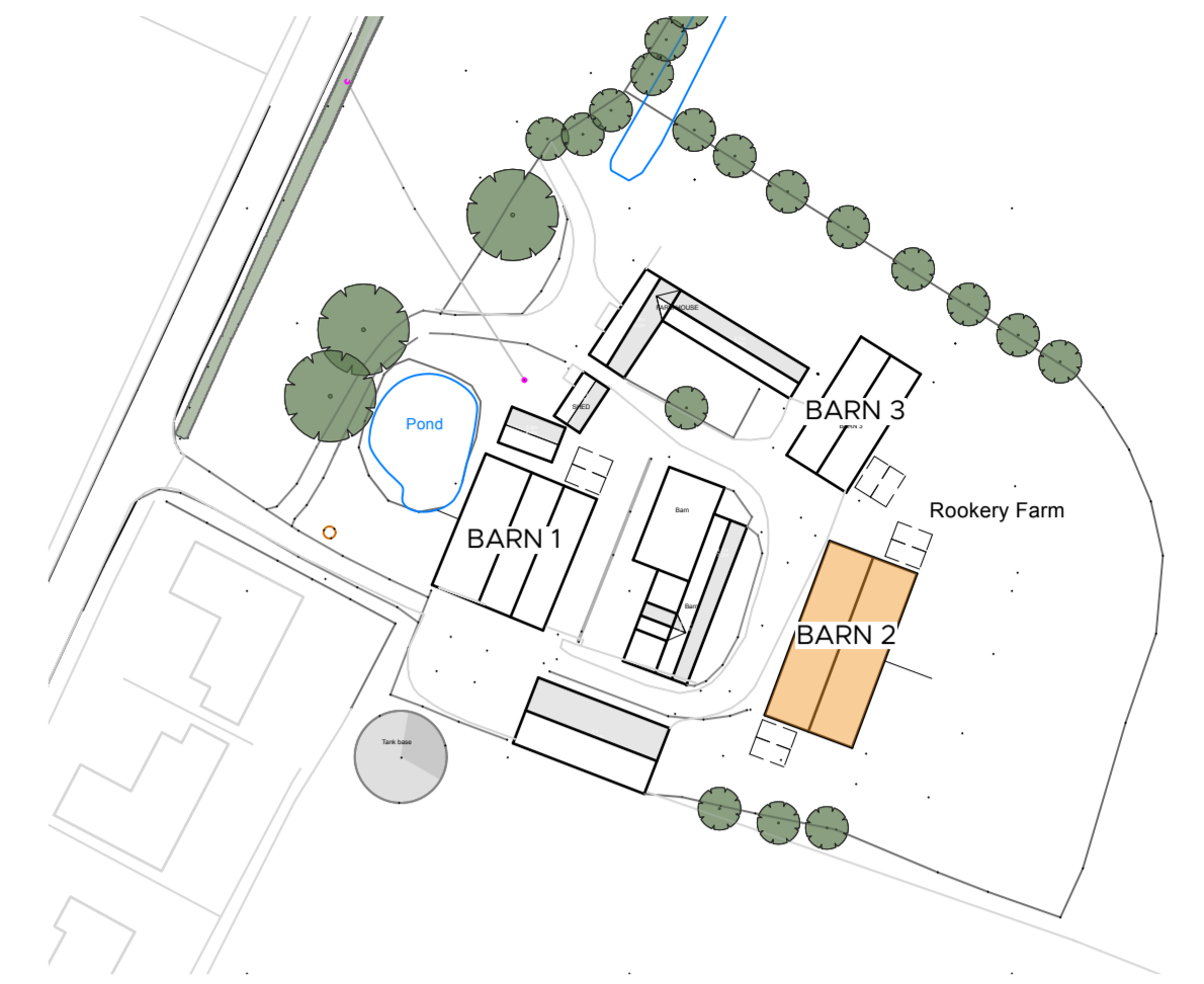
SITE KEY PLAN 1:1000