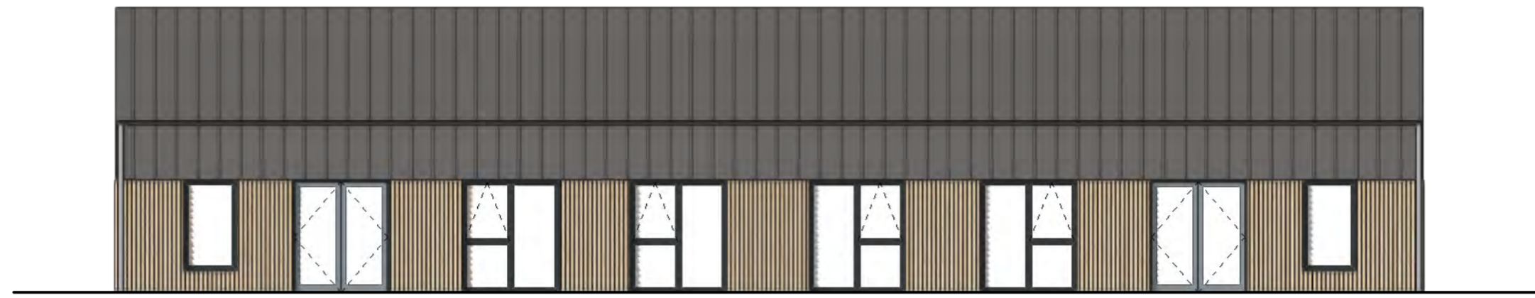
PROPOSED EAST ELEVATION Scale: 1:100