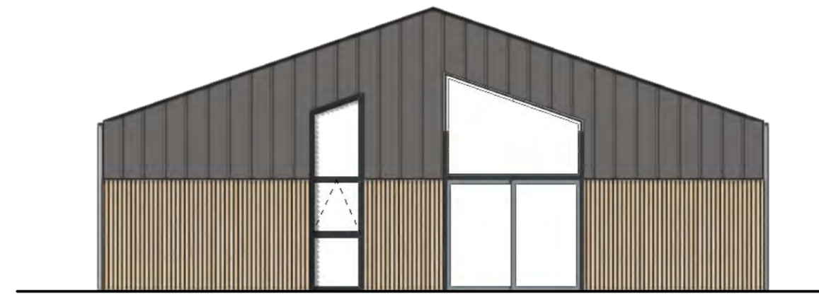
PROPOSED SOUTH ELEVATION Scale: 1:100