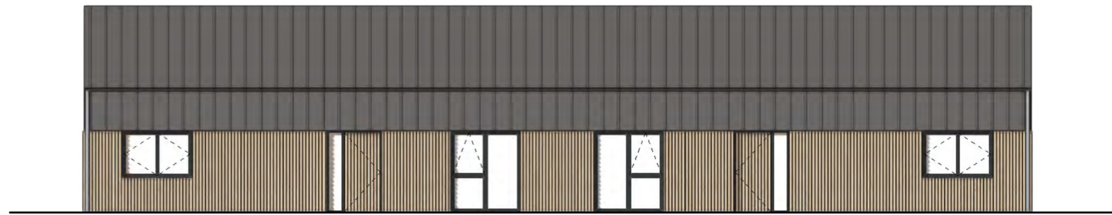
PROPOSED WEST ELEVATION Scale: 1:100