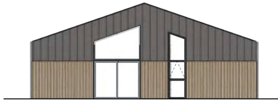
PROPOSED NORTH ELEVATION Scale: 1:100