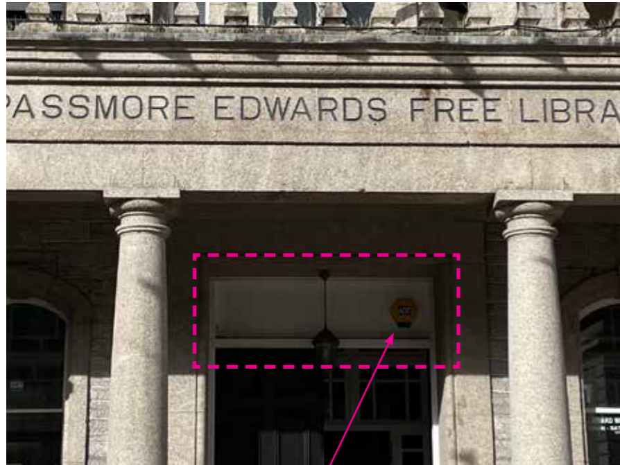
Alarm to be moved/covered up - TBC