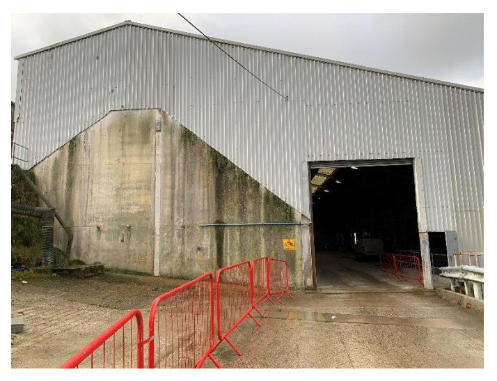
Linhay Building - East elevation, main entrance