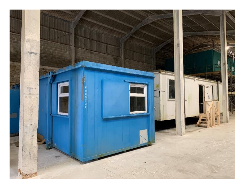
Linhay Building - Ground floor containerised laboratory blocks