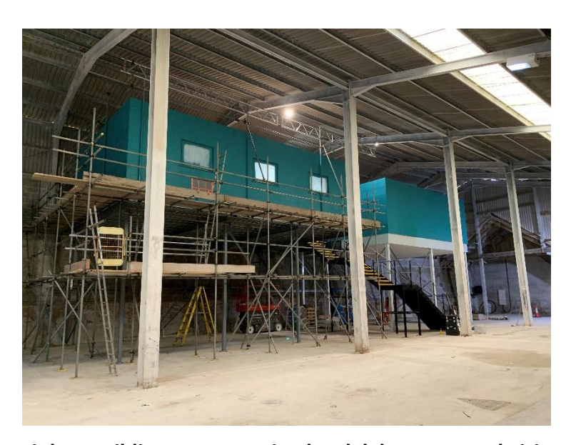
Linhay Building - Mezzanine level, laboratory and visitor centre