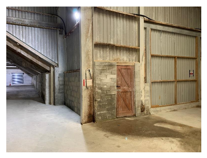
Linhay Building - Existing exit to West