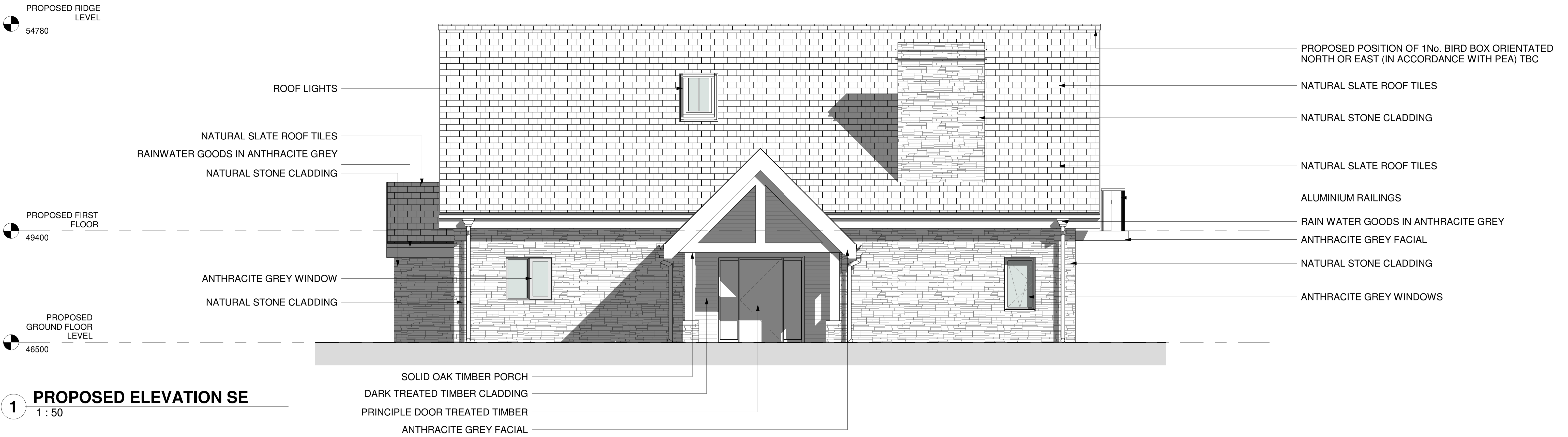
1 PROPOSED ELEVATION SE 1 : 50