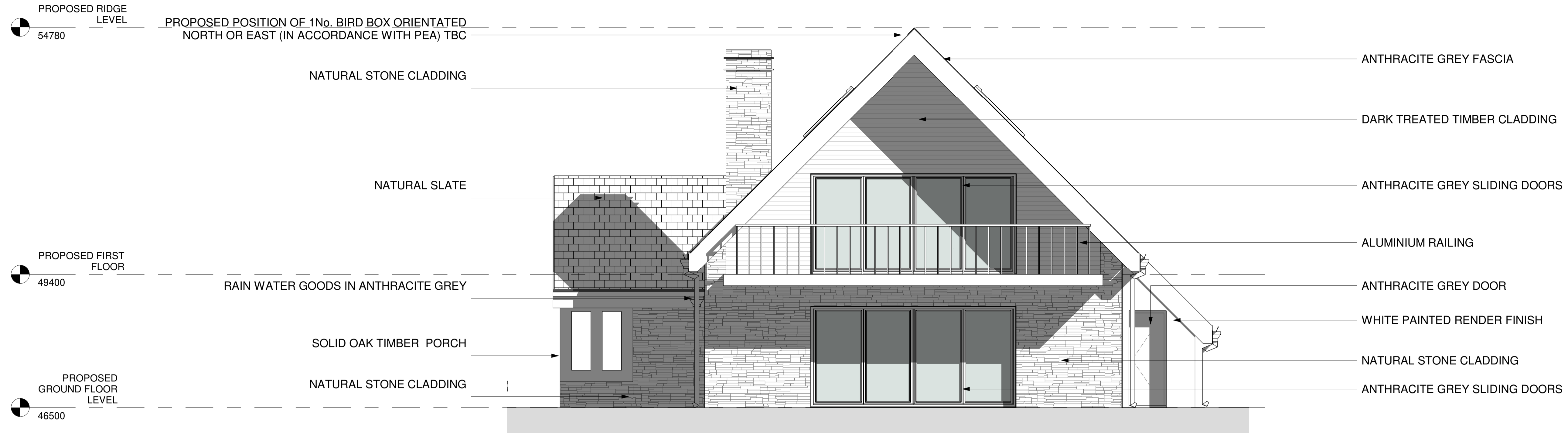
1 PROPOSED ELEVATION NE 1 : 50