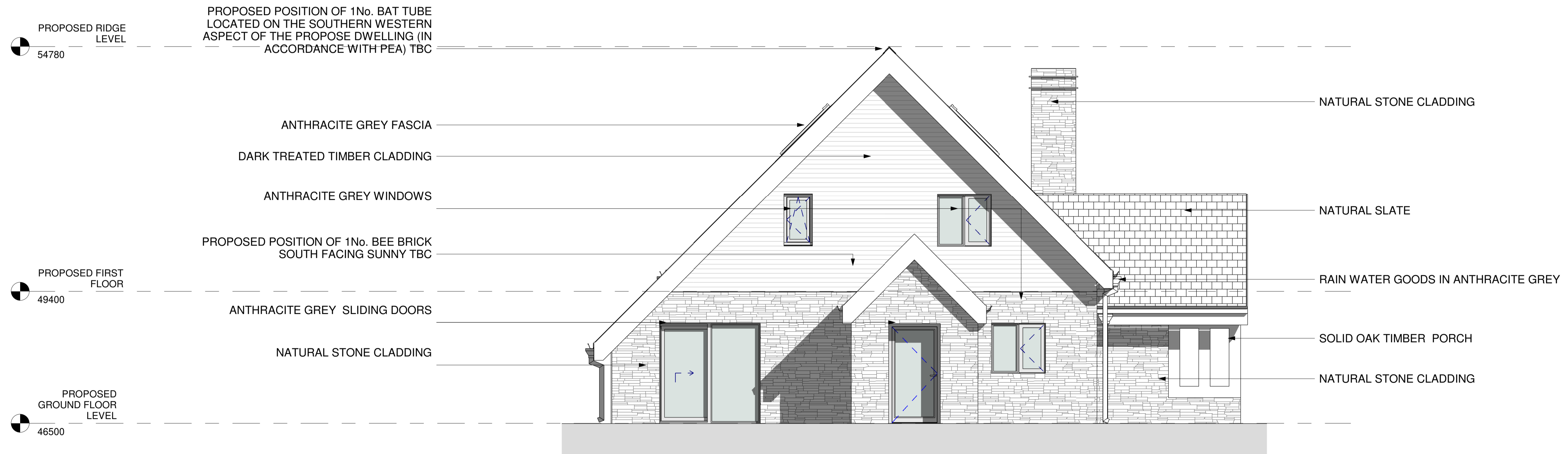
2 PROPOSED ELEVATION SW 1 : 50