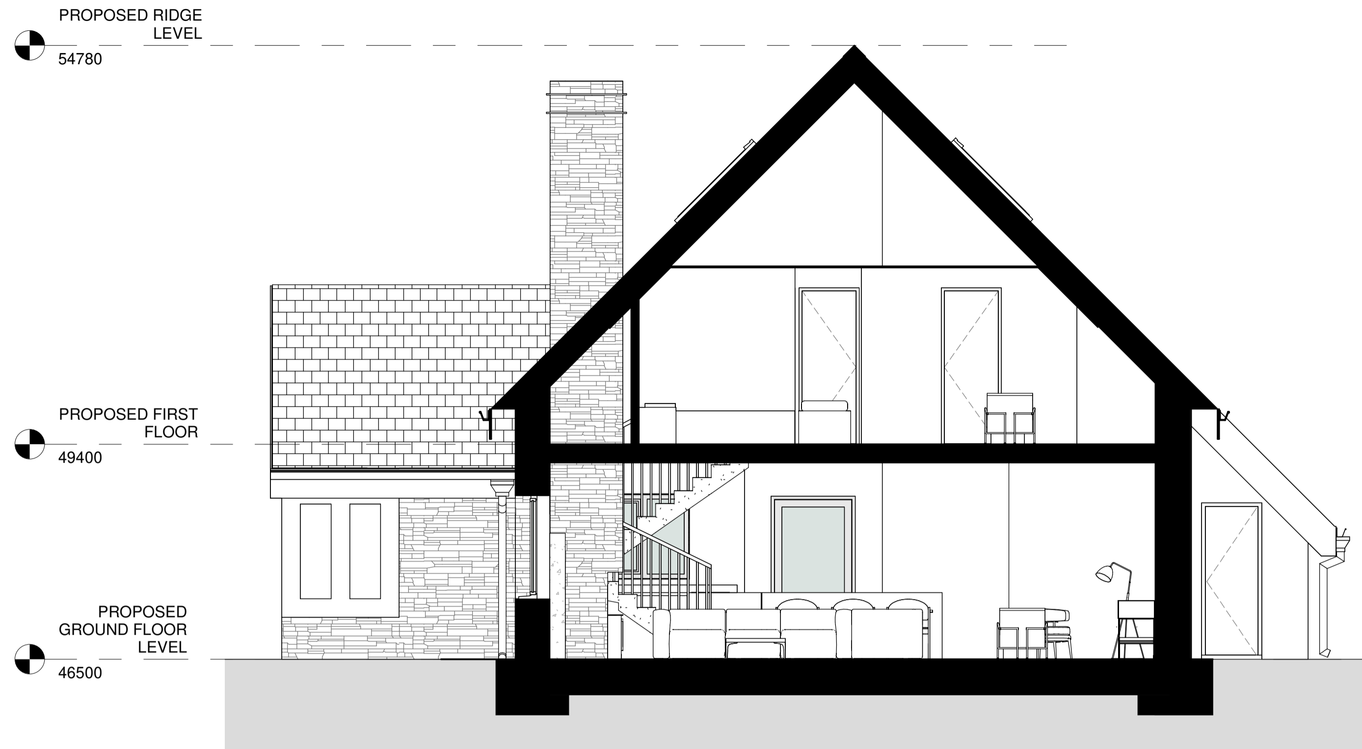
1 Section 1 1 : 50