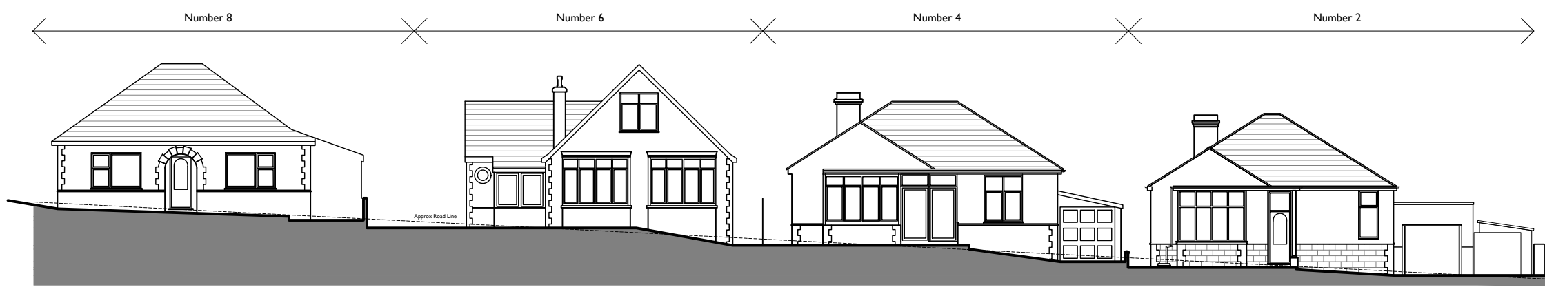
Existing Street Elevation