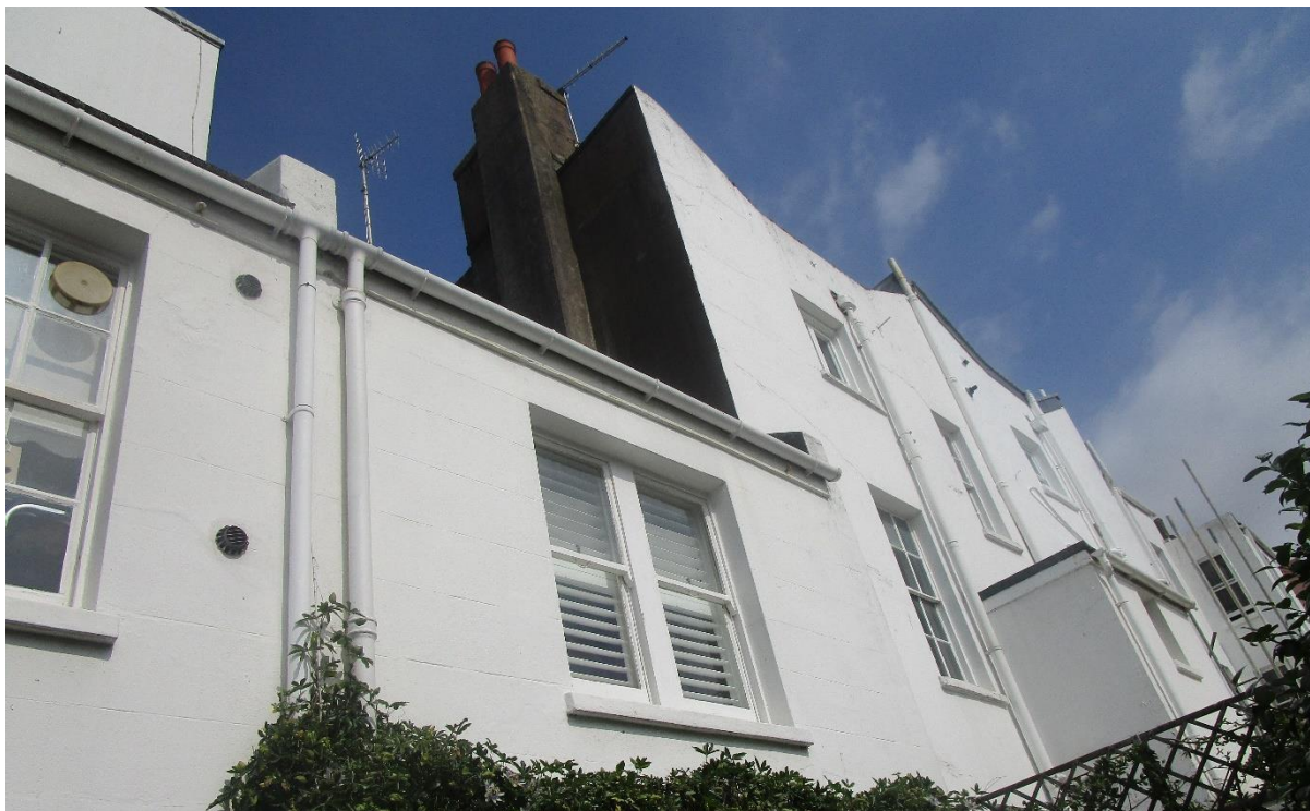
PHOTO 01 Twds top right of rear elevation. Right side neighbour gable evident