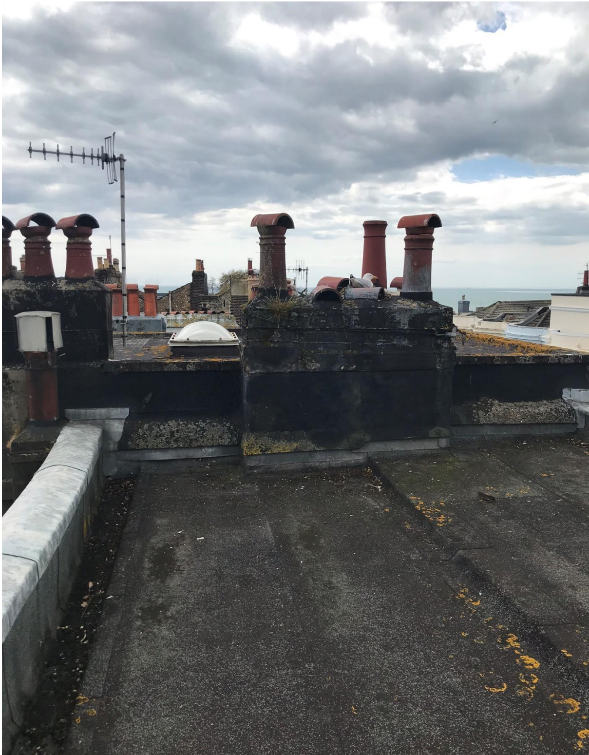
PHOTO 07 View from roof illustrating limited overlooking Design and Access Statement – 45 Norfolk Road, Brighton BN1 3AB Installation of AC Unit to Planning Approved Roof Terrace