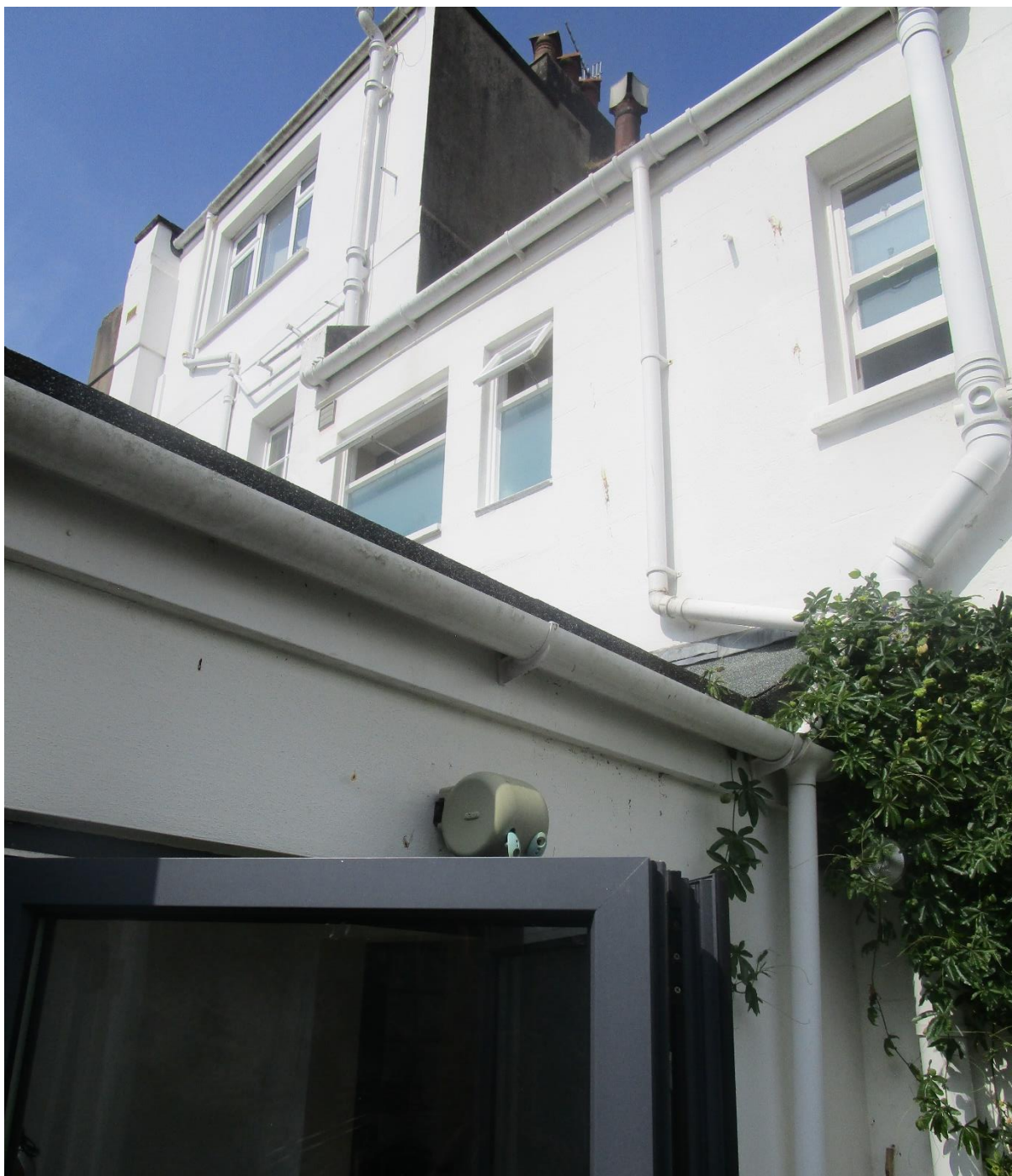
PHOTO 02 Twds top left of rear elevation. Left side neighbour gable evident

Design and Access Statement – 45 Norfolk Road, Brighton BN1 3AB