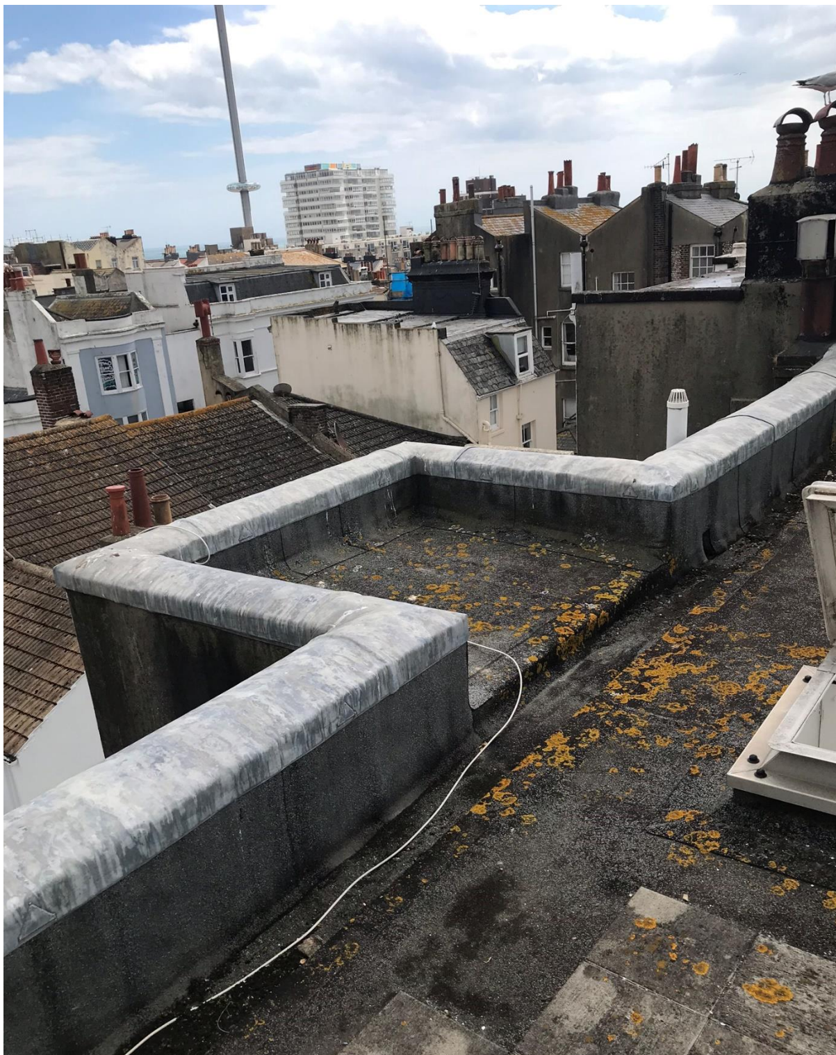
PHOTO 03 Existing flat roof view twds rear illustrating limited overlooking

Design and Access Statement – 45 Norfolk Road, Brighton BN1 3AB Installation of AC Unit to Planning Approved Roof Terrace