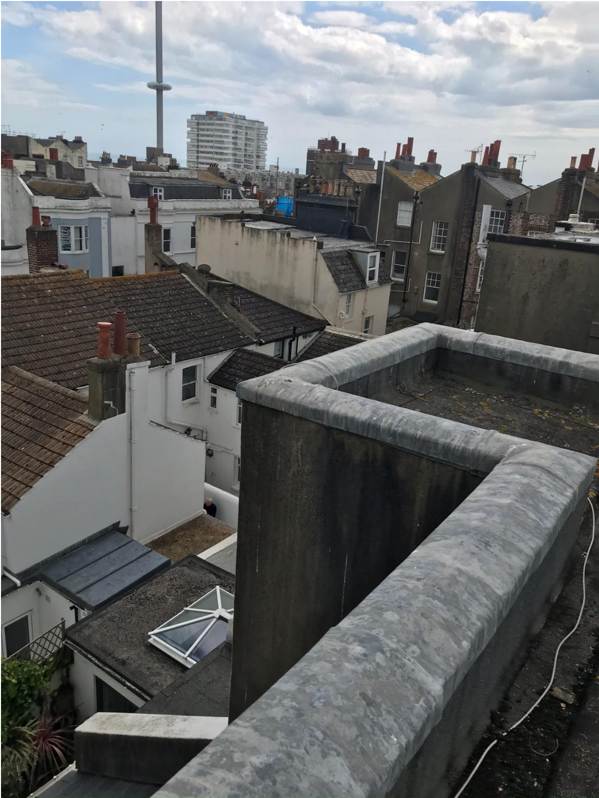
PHOTO 06 View from roof illustrating limited overlooking

Design and Access Statement – 45 Norfolk Road, Brighton BN1 3AB