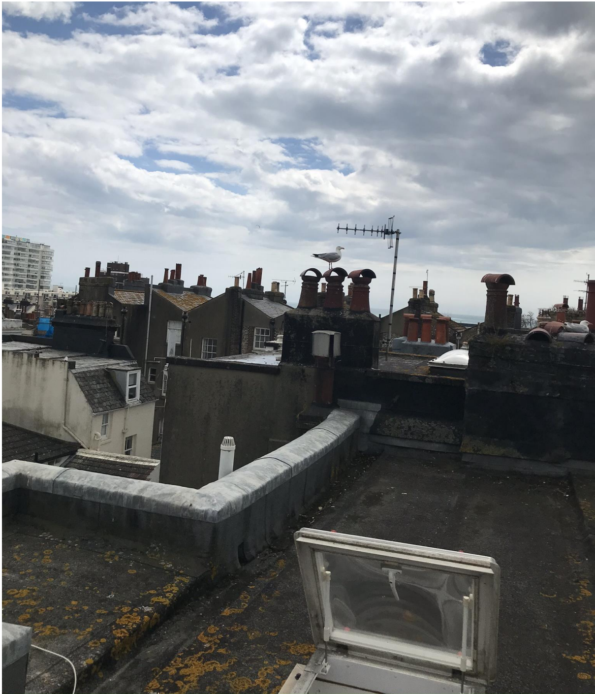
PHOTO 04 Existing flat roof view twds rear showing existing access hatch

Design and Access Statement – 45 Norfolk Road, Brighton BN1 3AB Installation of AC Unit to Planning Approved Roof Terrace