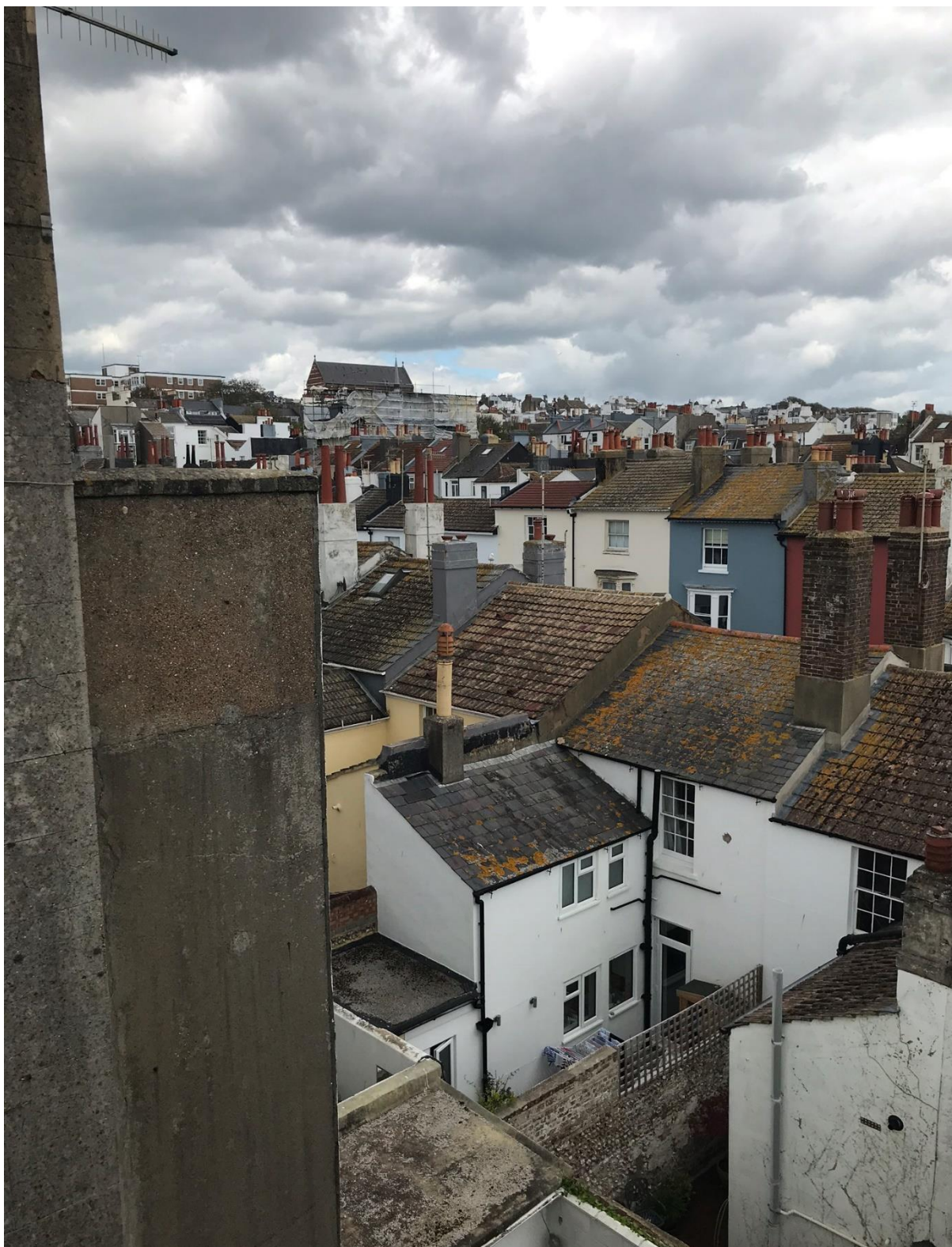
PHOTO 08 View from roof illustrating limited overlooking

Design and Access Statement – 45 Norfolk Road, Brighton BN1 3AB