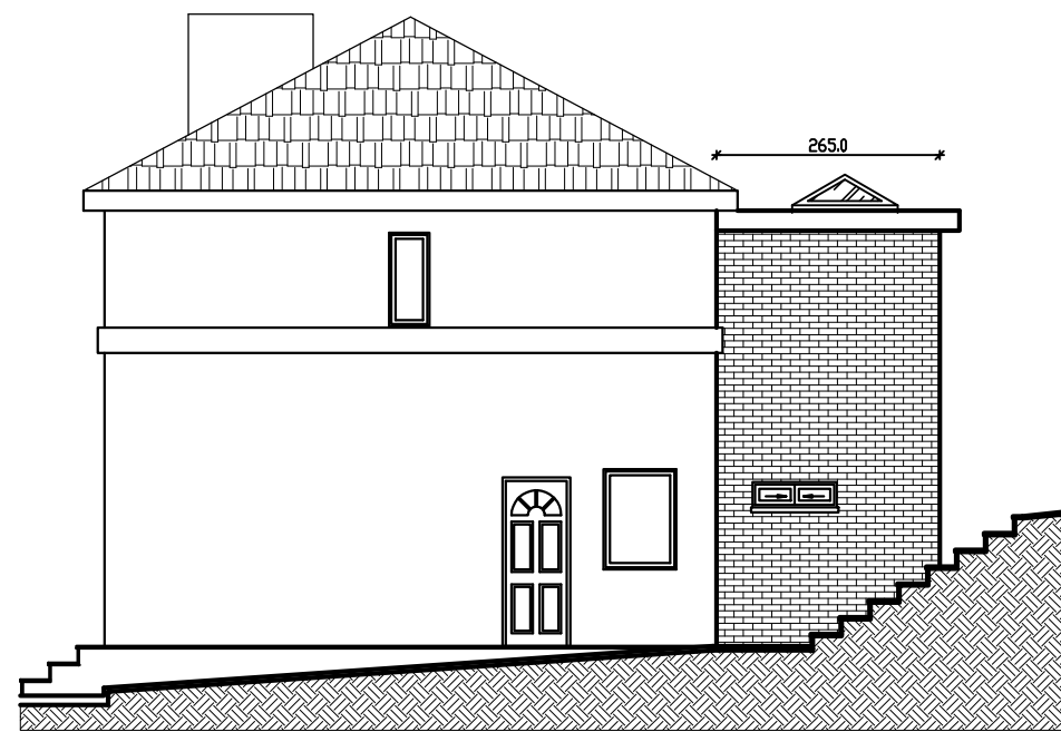
PROPOSED ELEVATION: SOUTH 1:100