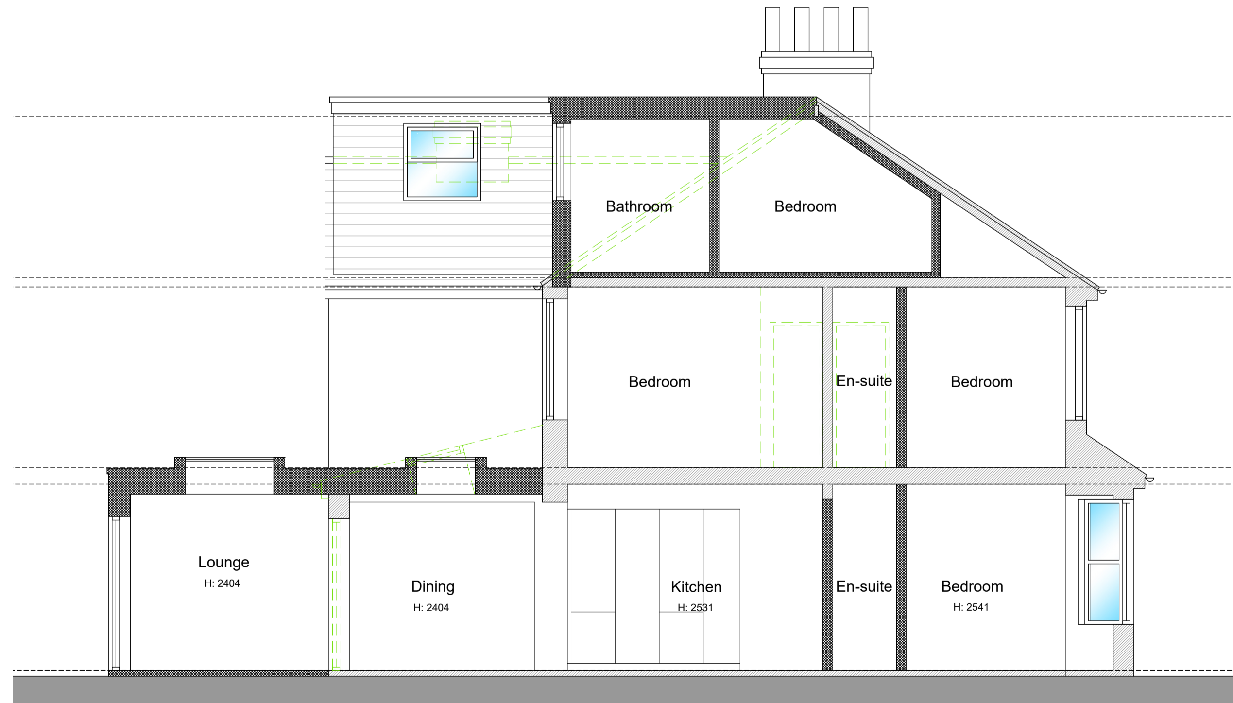
Proposed Section 1:50 @ A1