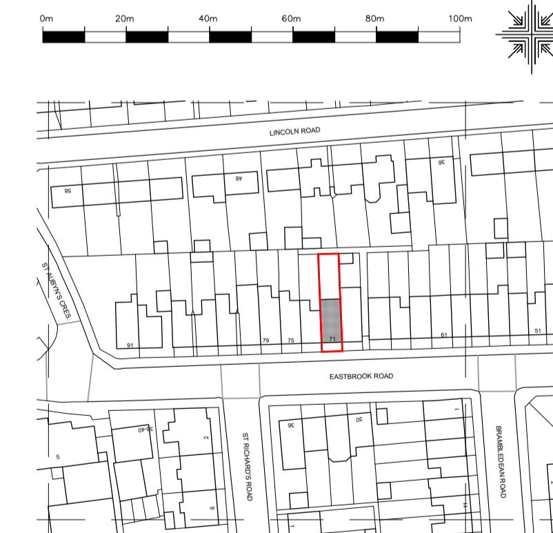
Location Plan 1:1250 @ A1