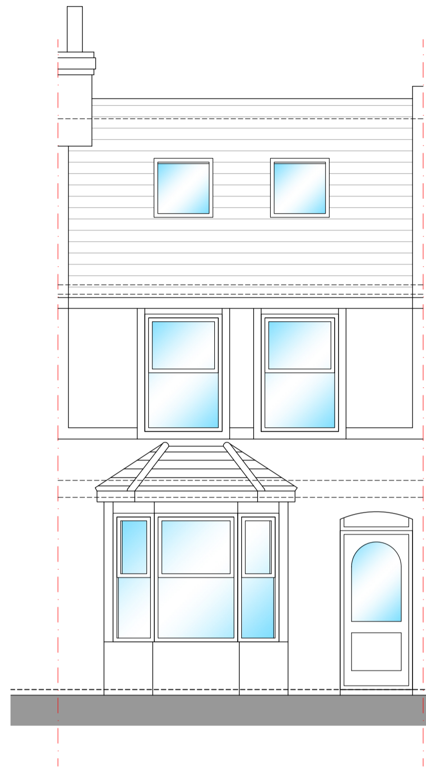
Proposed Front Elevation 1:50 @ A1