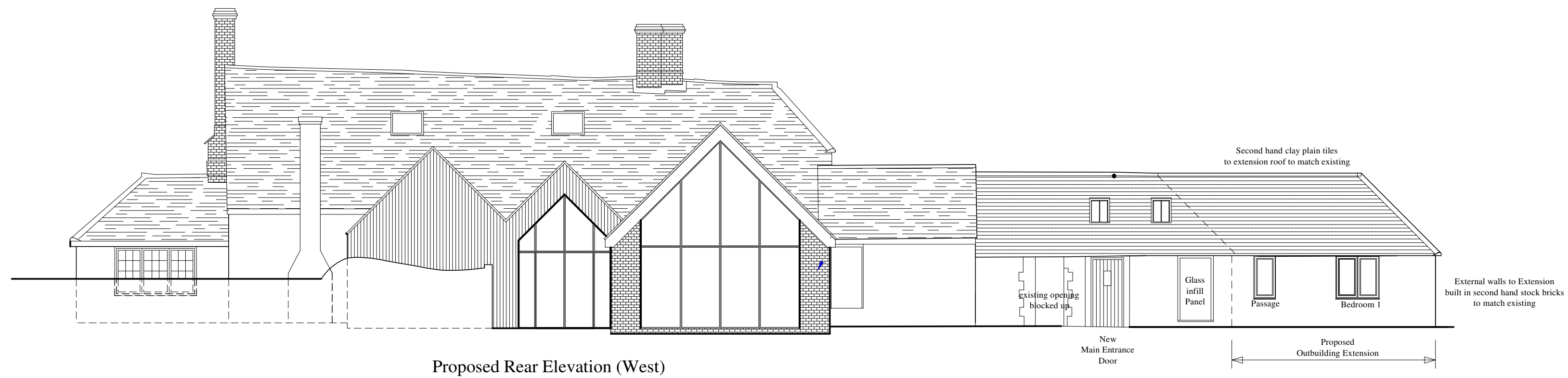
Proposed Rear Elevation (West)