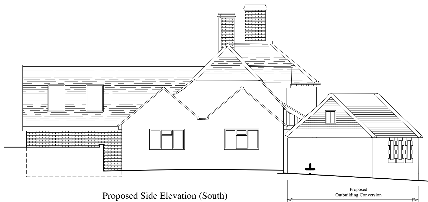
Proposed Side Elevation (South)