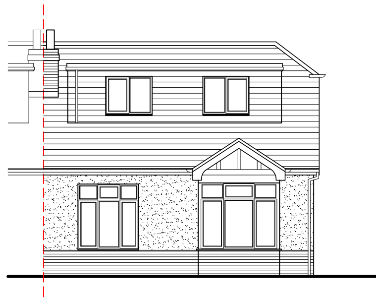
East (front) elevation (unchanged in new proposal)