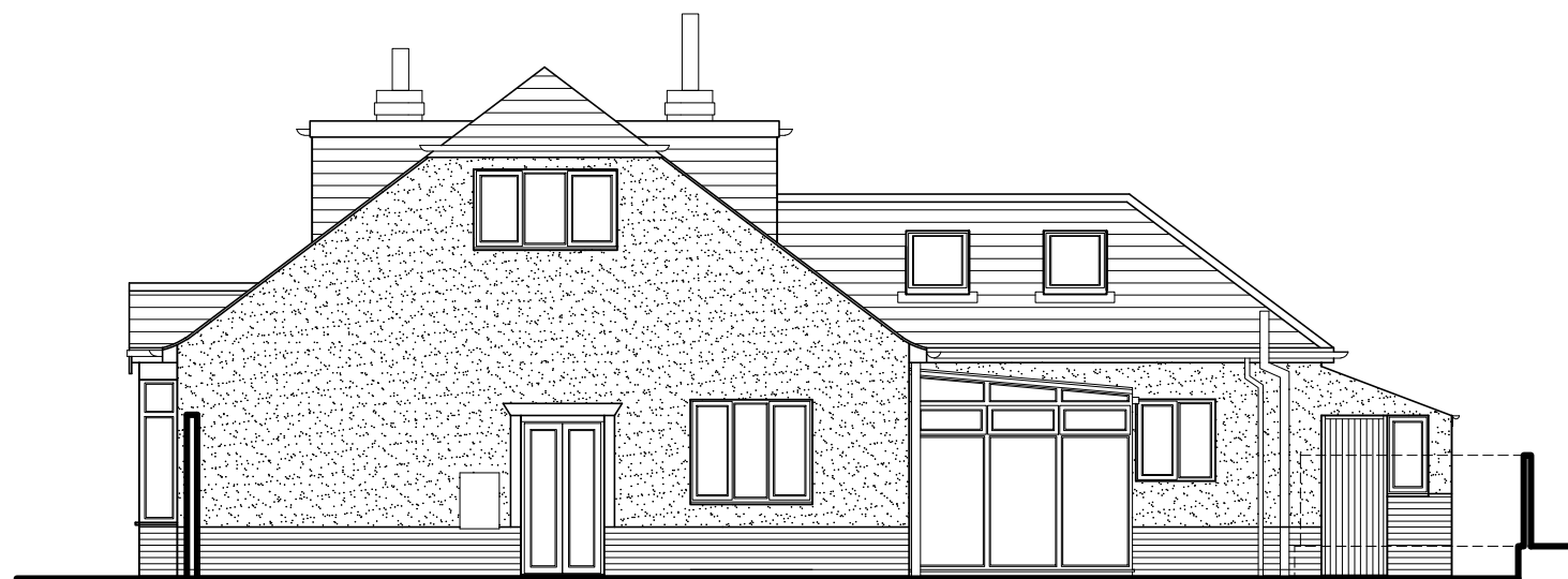
North (side) elevation