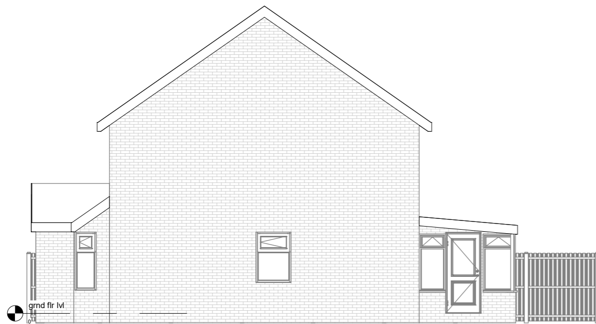
Existing Elevation-Right side