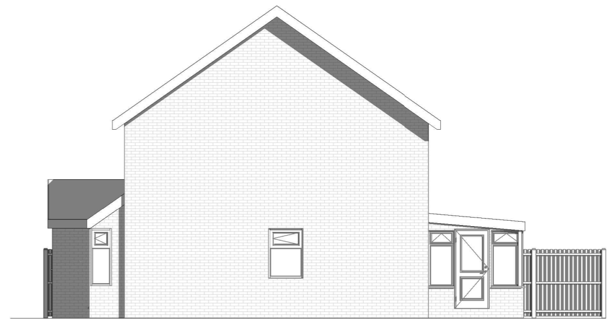
Proposed Elevation-Right side