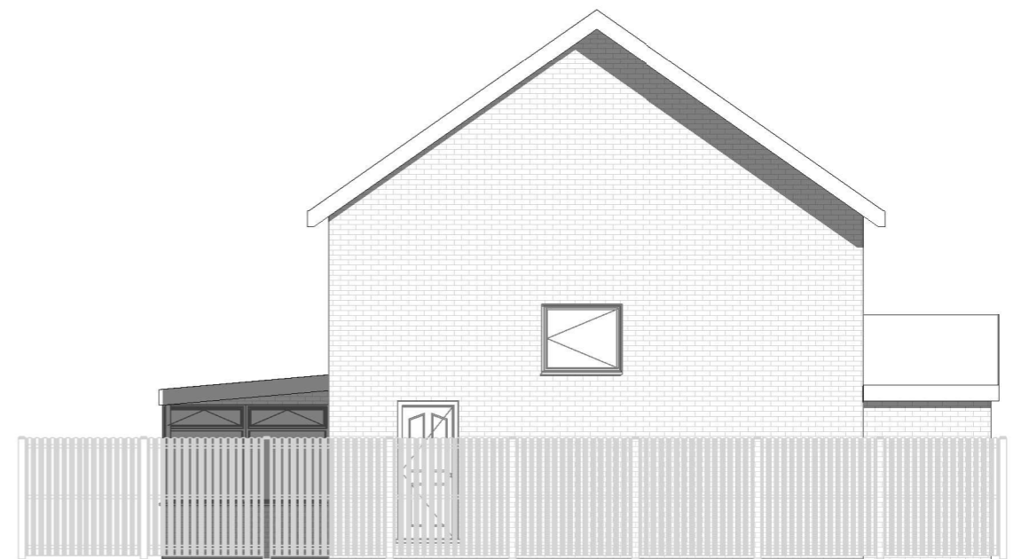
Proposed Elevation-Left side