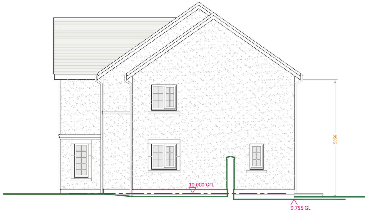
Existing East Elevation scale 1:100