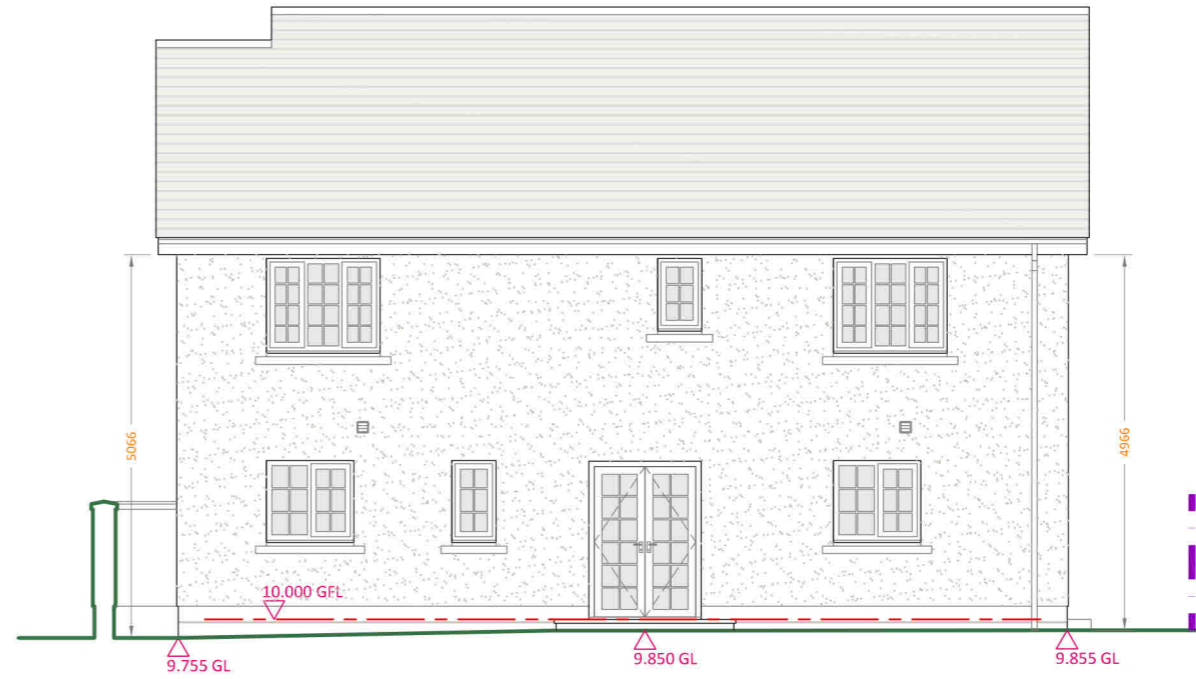
Existing North Elevation scale 1:100