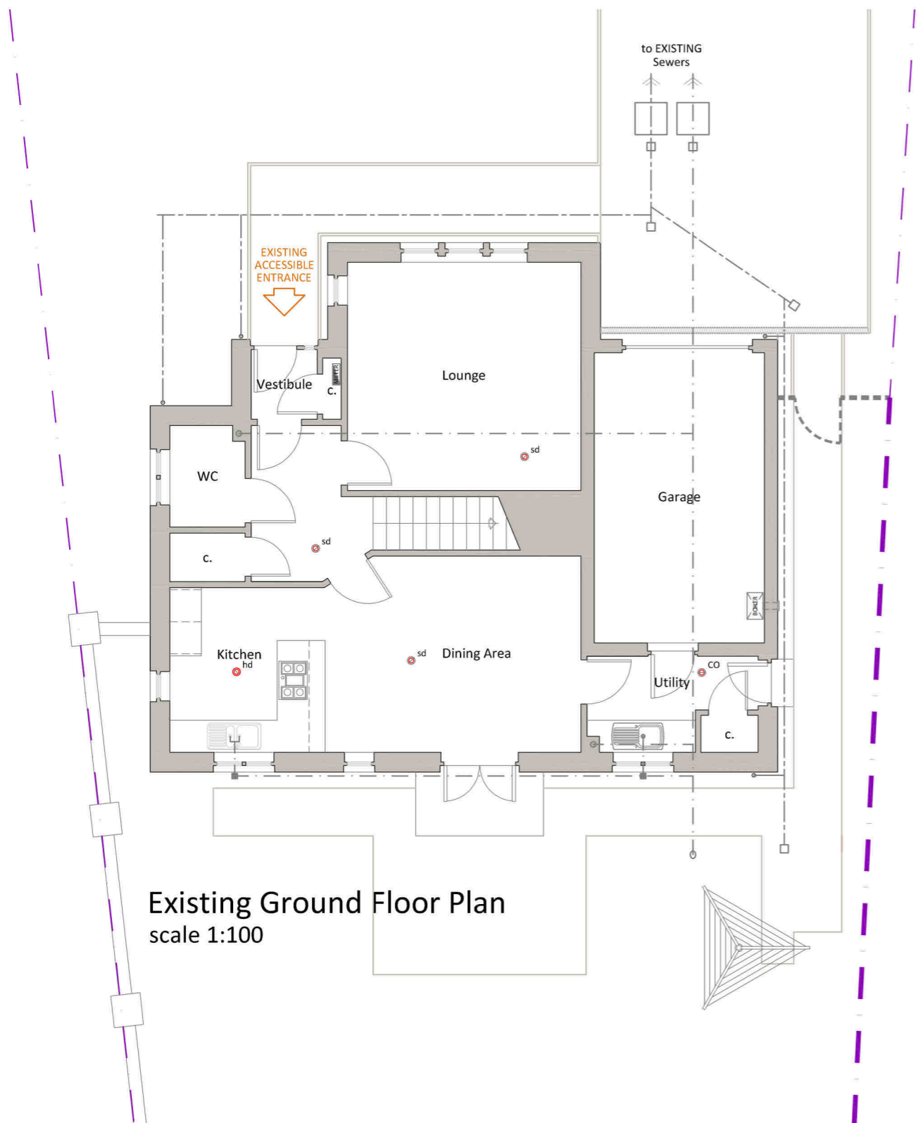
Existing Ground Floor Plan scale 1:100