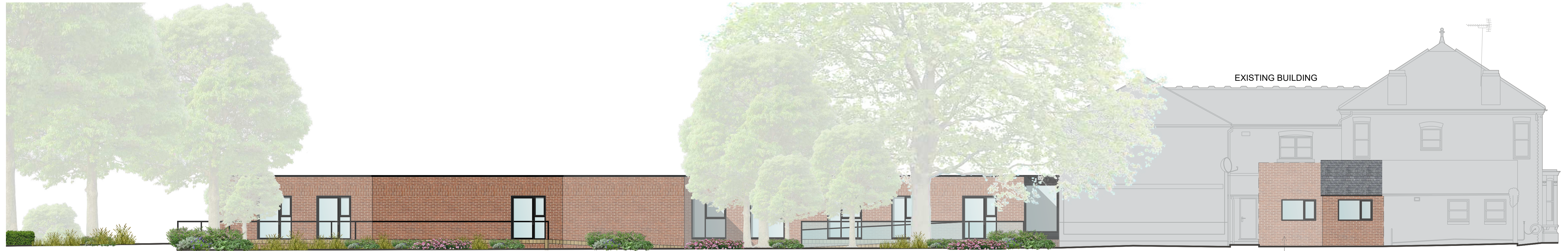
PROPOSED ELEVATION A