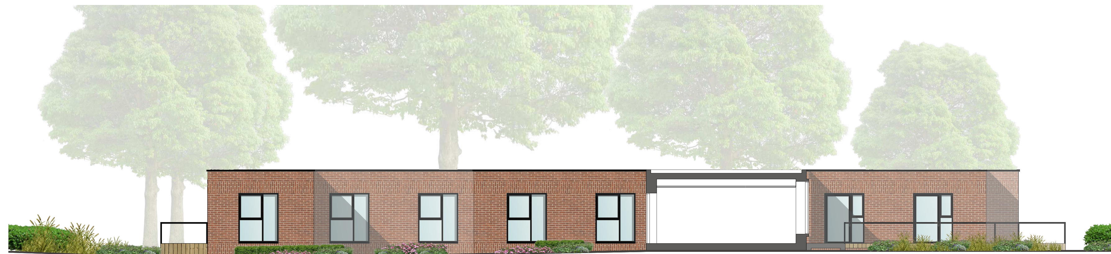
PROPOSED SECTION DD