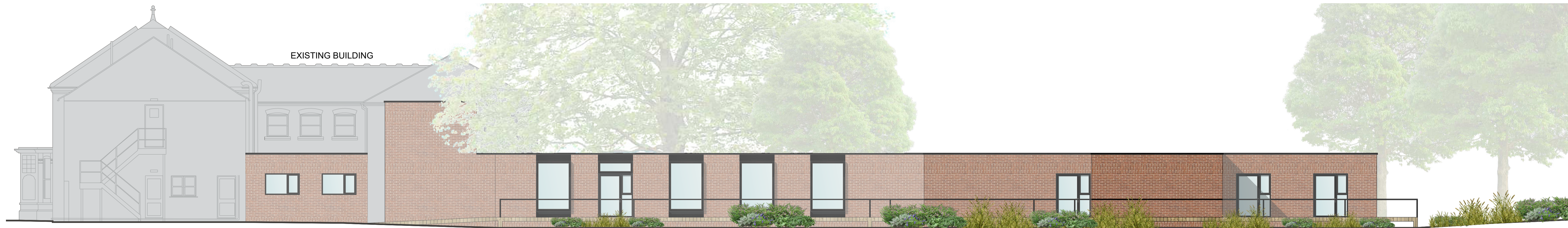
PROPOSED ELEVATION C