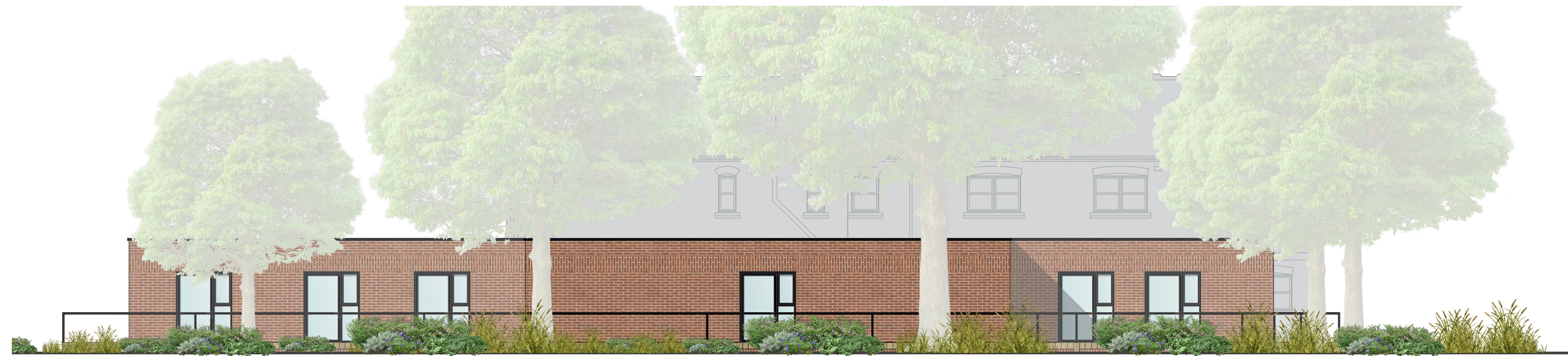
PROPOSED ELEVATION B