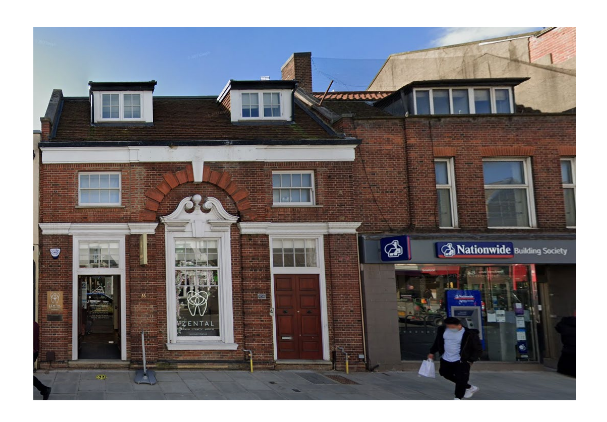
Listed buildings No. 114-118 High Street are situated opposite the application site: