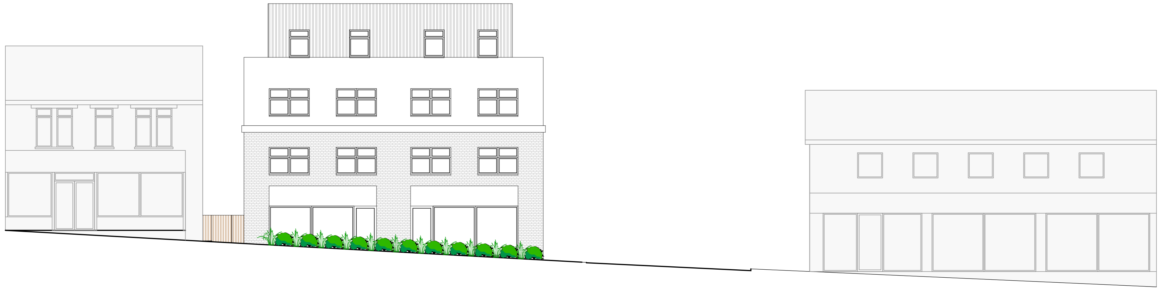
Proposed Street Scene Scale 1:100