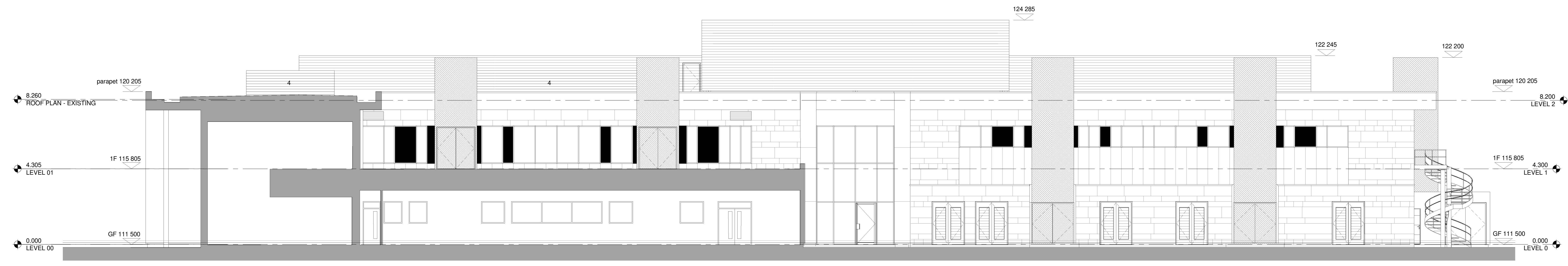
Proposed South Elevation to Courtyard SCALE: 1 : 100