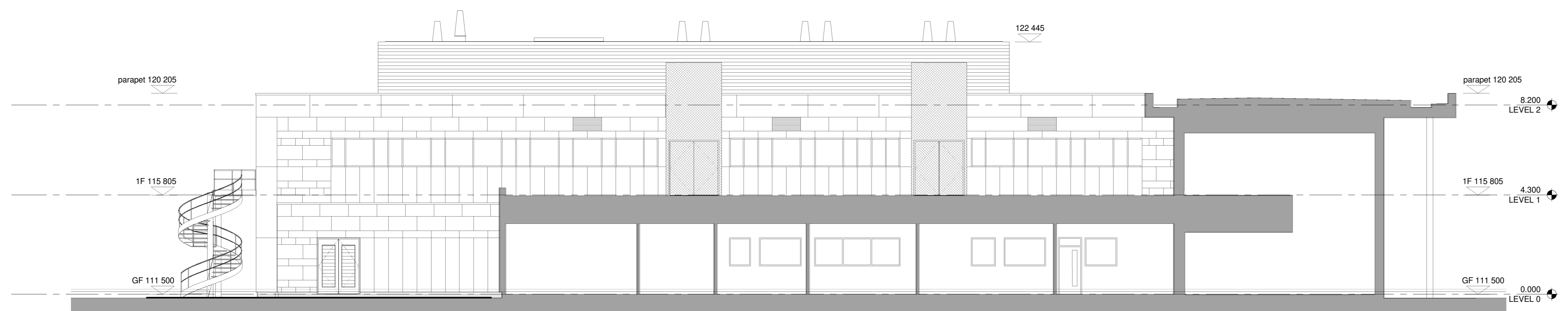
Proposed North Elevation to Courtyard SCALE: 1 : 100

This drawing has been prepared solely for the use of CPI (Centre for Process Innovation) and there are no representations of any kind made by NORR Consultants Limited to any party with whom NORR Consultants Limited has not entered into a contract. This drawing must not be used, reproduced or revised without written permission. This drawing shall not be used for construction purposes until a "As-APPROVED FOR STAGE x" status appears under the Sheet Status. Constructors must only work to figured dimensions which are to be checked on site. Do not scale from hard copy drawings.