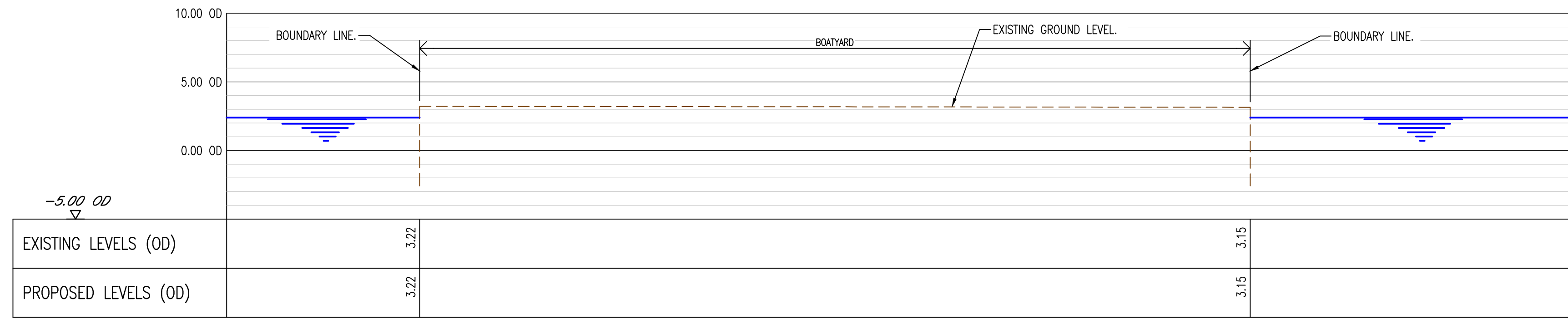
SECTION 1-1. SCALE 1:250