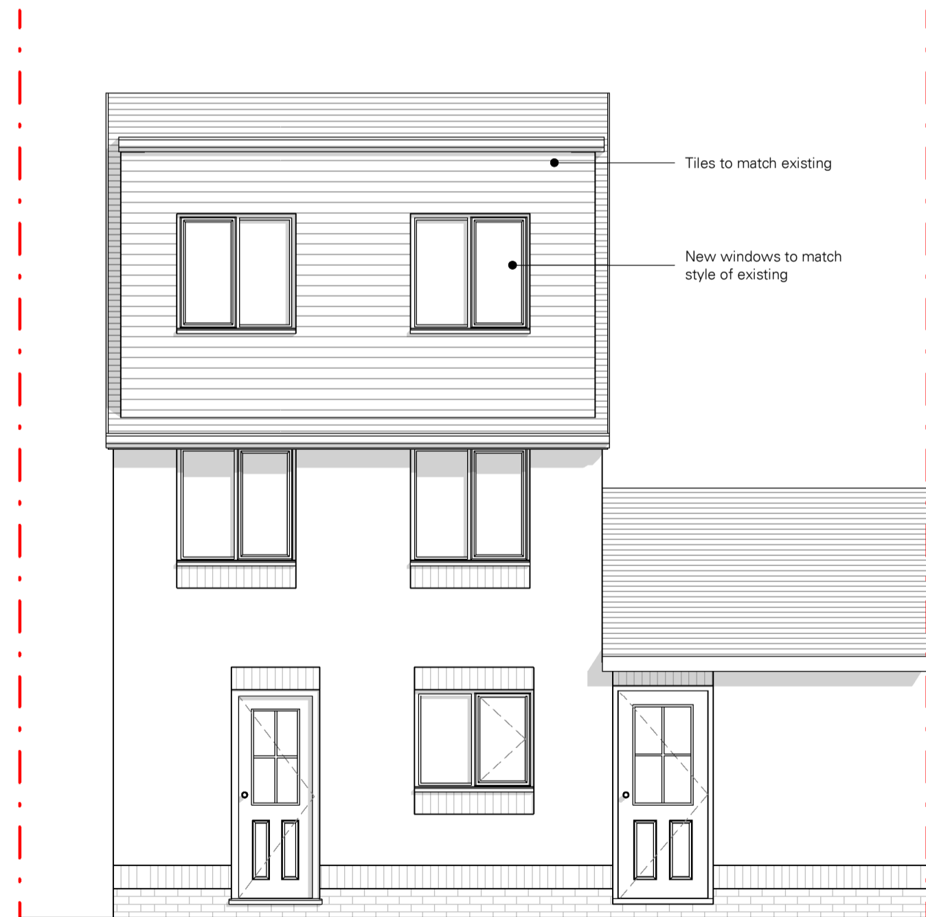
3 Proposed_North 1 : 50