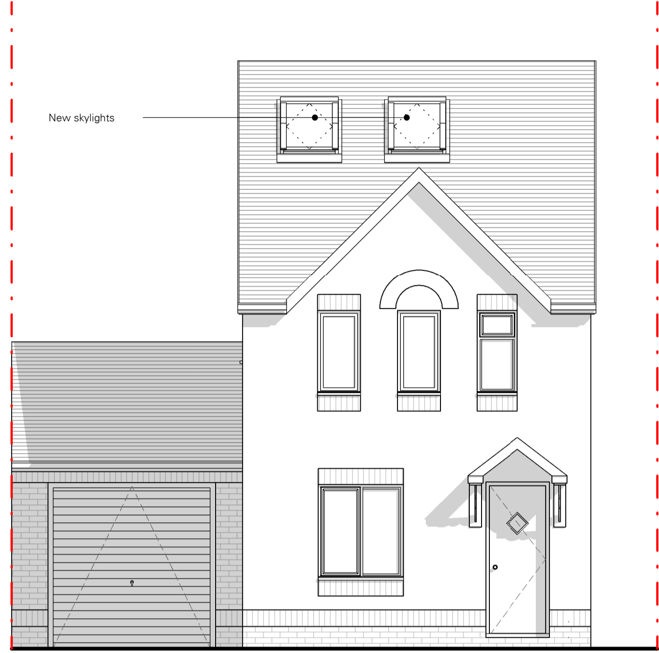
1 Proposed_South 1 : 50