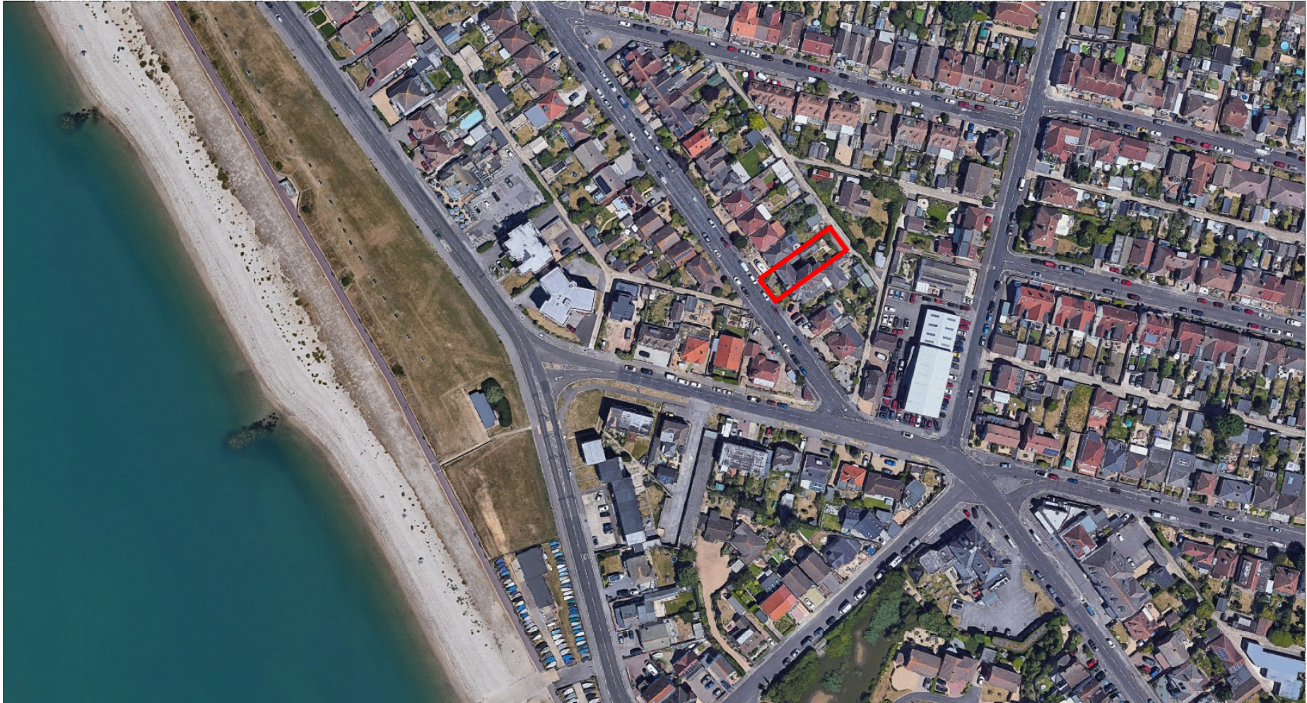
Aerial Photo