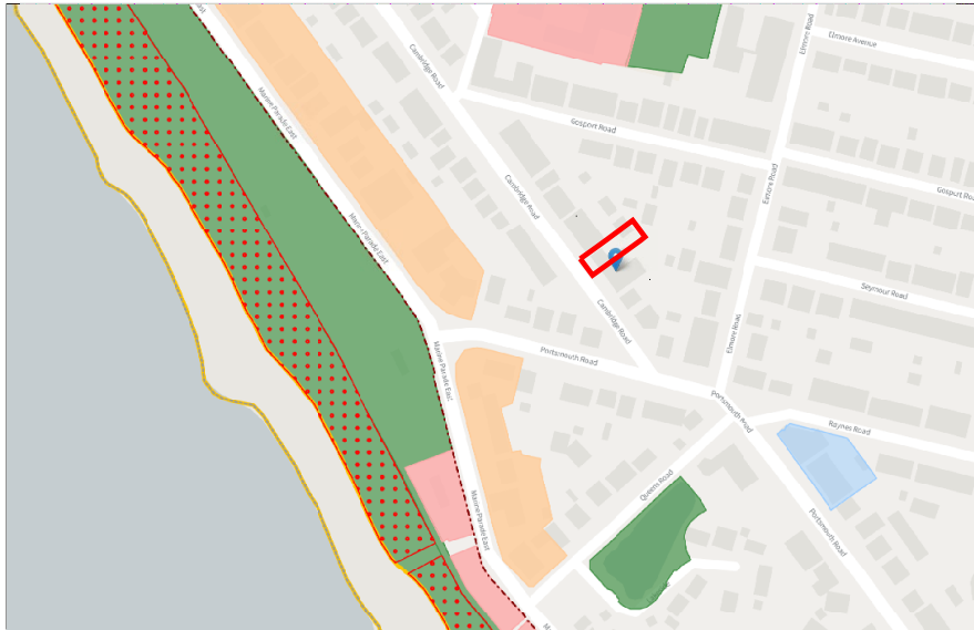
Gosport Local Plan Map Extract

3.1 The application site falls within the established settlement boundary as identified in the Gosport Local Plan. It sits beyond the High Street conservation area (No. 14) and also outside of the Lee West Area of Special Character.