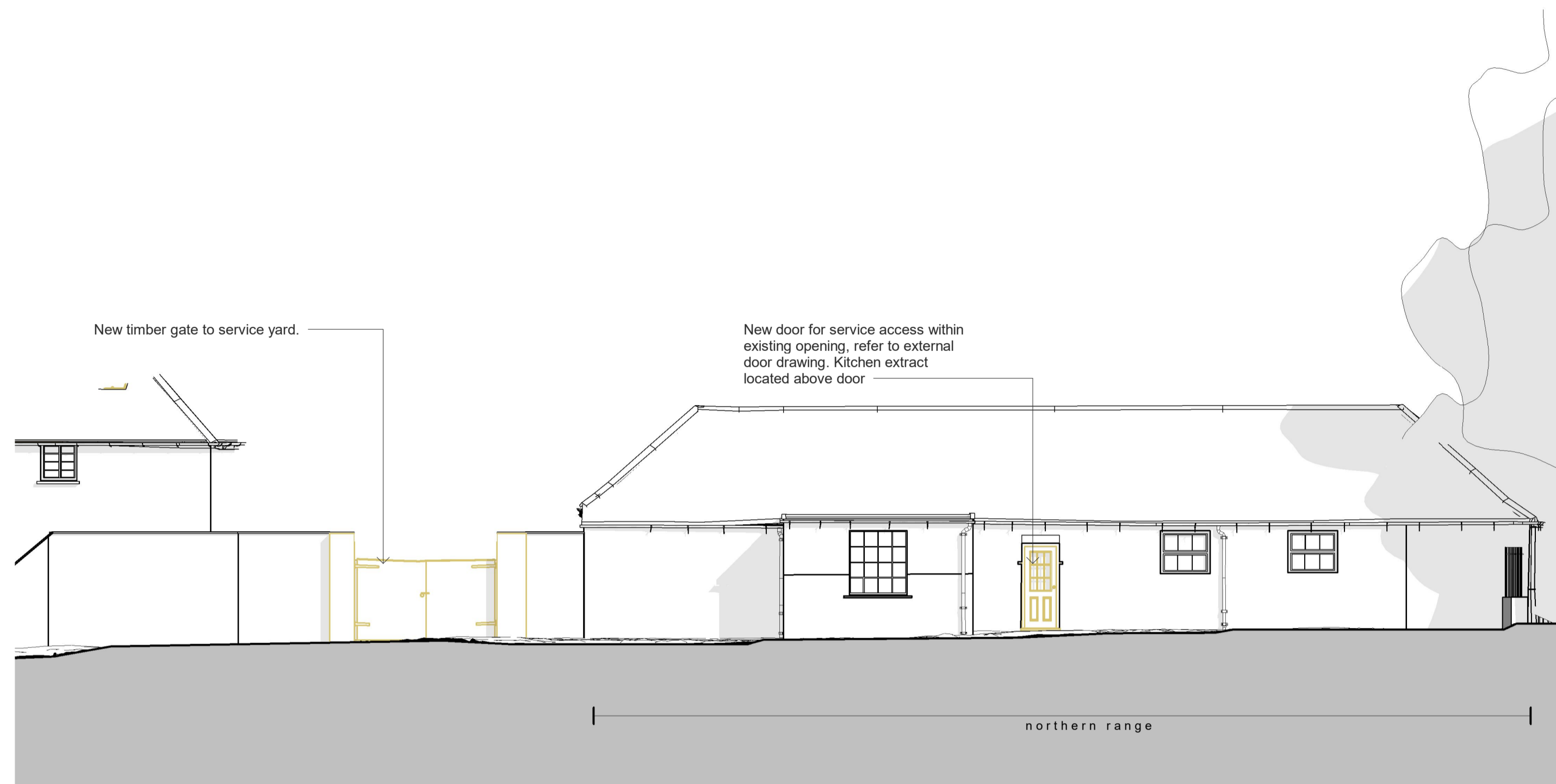
Elevation J - Proposed Annotated 1 : 100