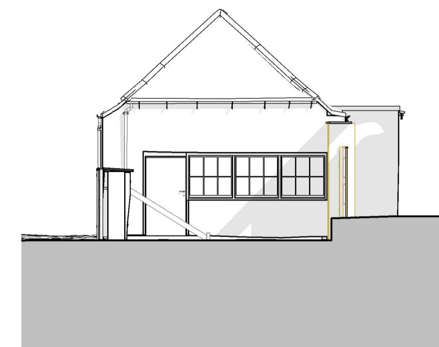
Elevation K - Proposed Annotated 1 : 100