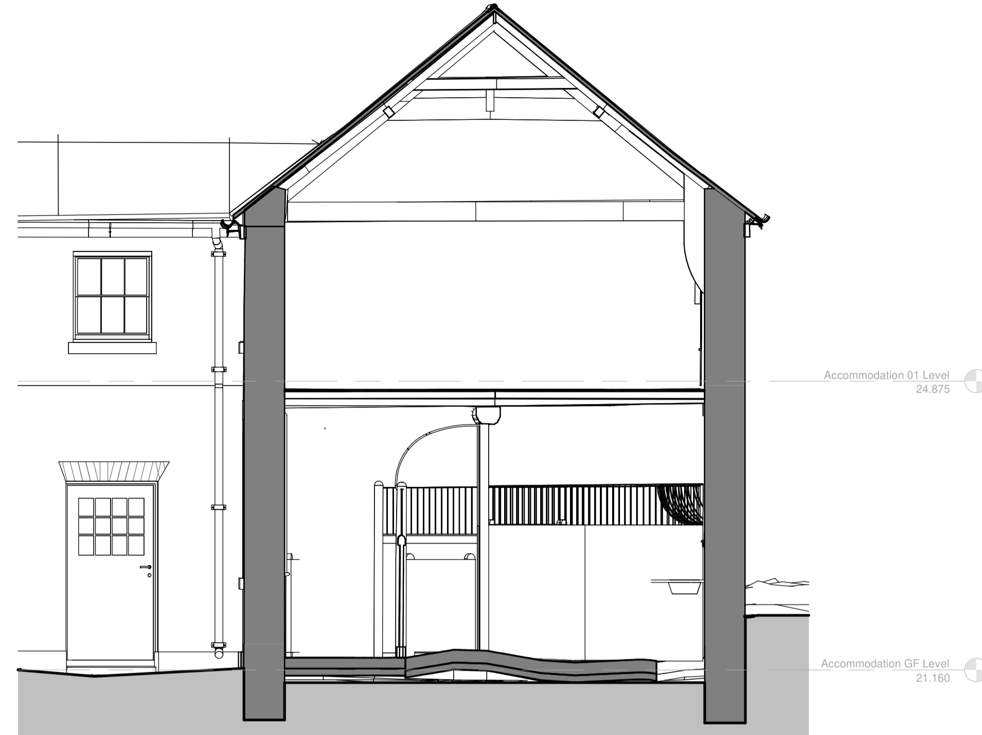
Section 02 - Existing 1 : 50