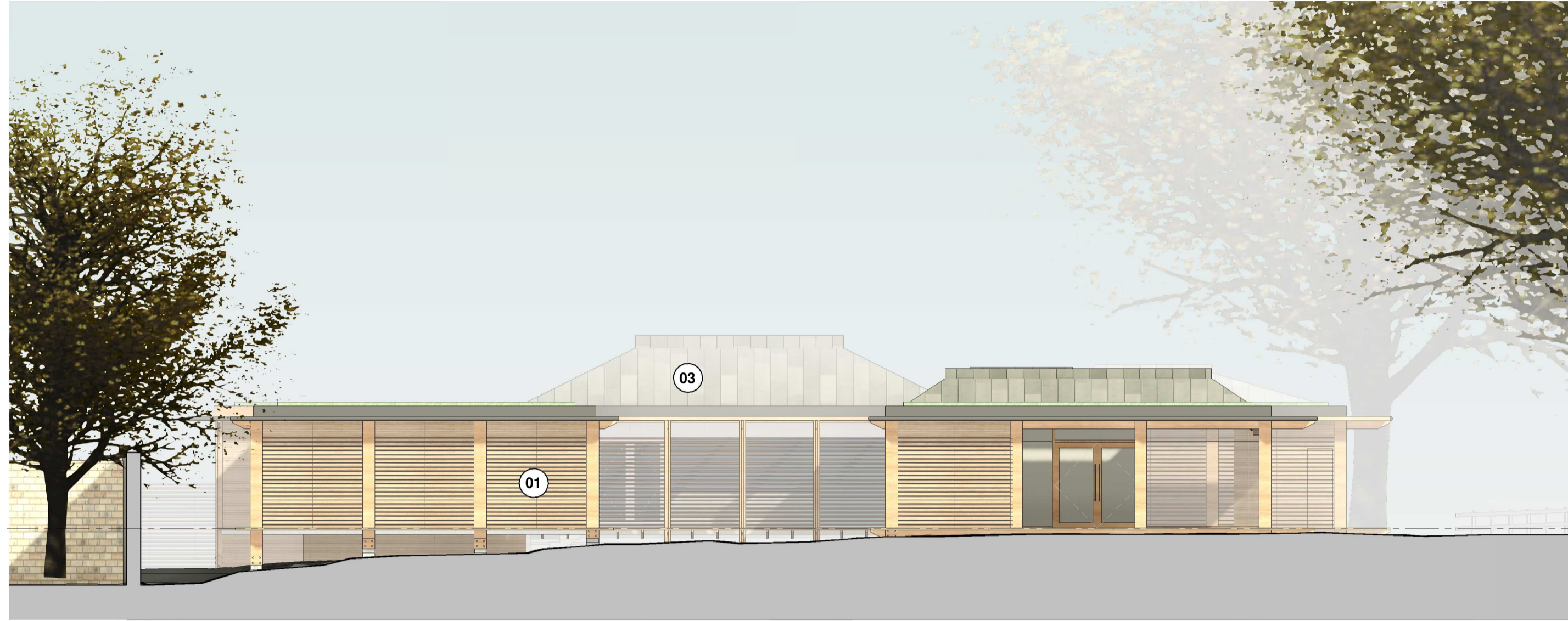
Elevation C - Proposed 1 : 100