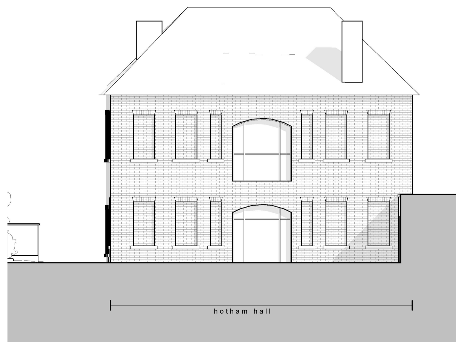
Elevation H - Demolitions 1 : 100

Notes --- To be demolished Existing ground floors: existing ground floors to be removed, unless otherwise stated. Existing floor finishes to be retained and reused where possible Existing first floors: existing modern chipboard timber floor covering to be removed, timber structure to be retained. Where lime ash floor is present, lime ash to be retained.