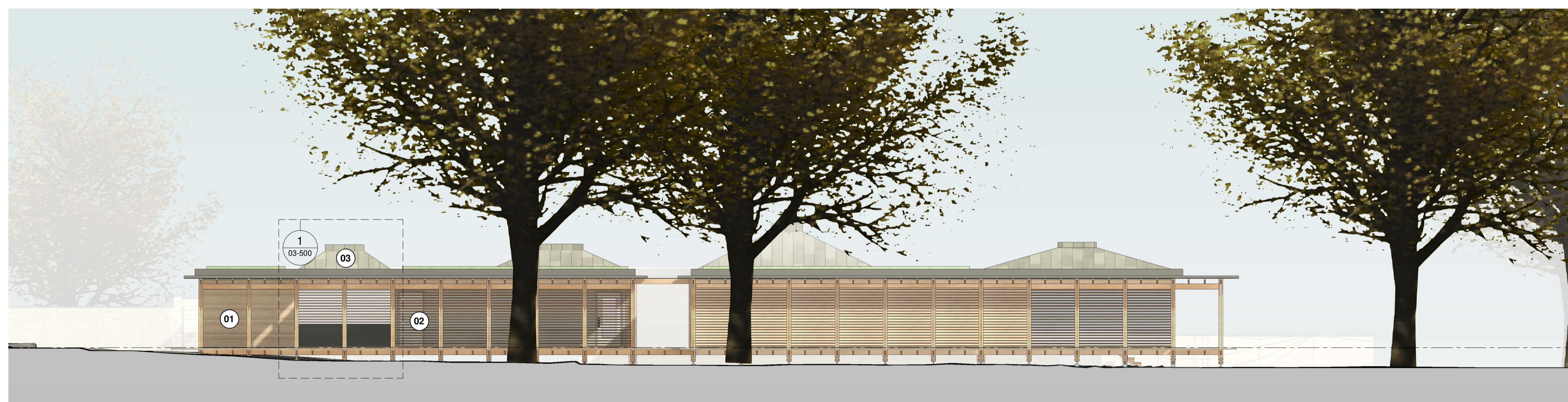
Elevation B - Proposed 1 : 100

refer to site wide elevations for existing elevations