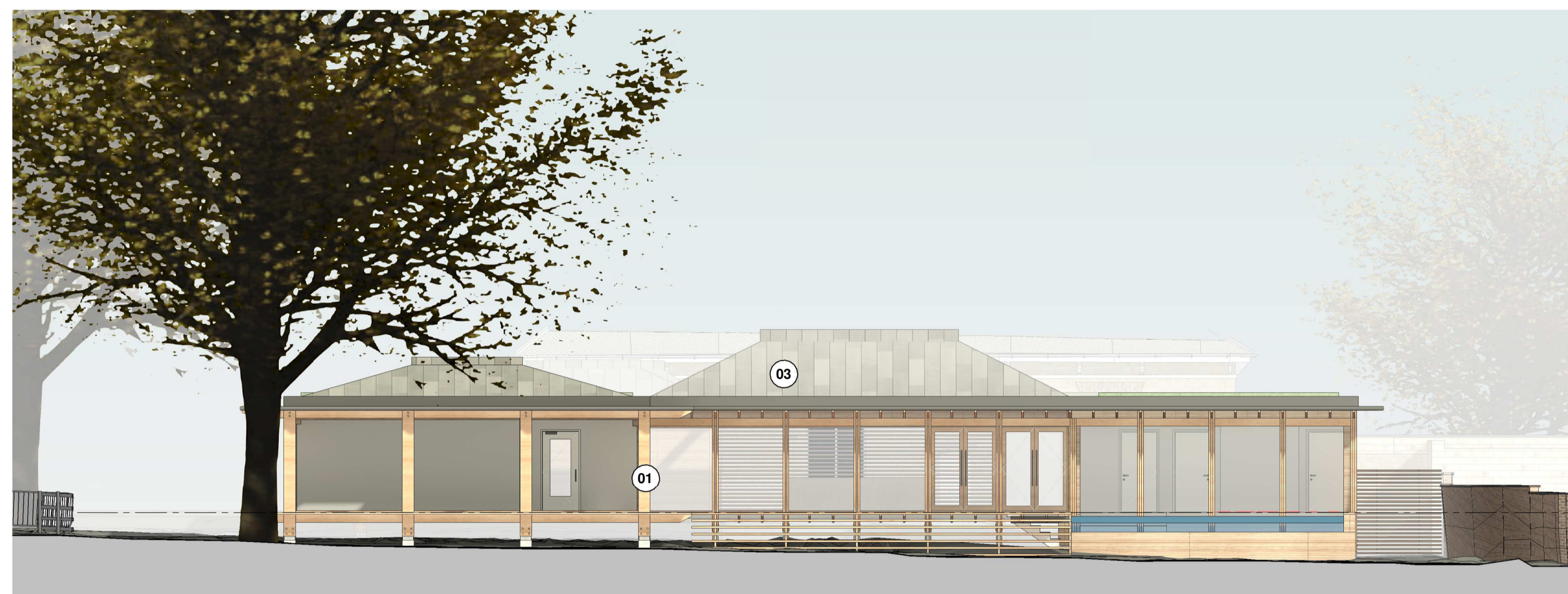
Elevation A - Proposed 1 : 100