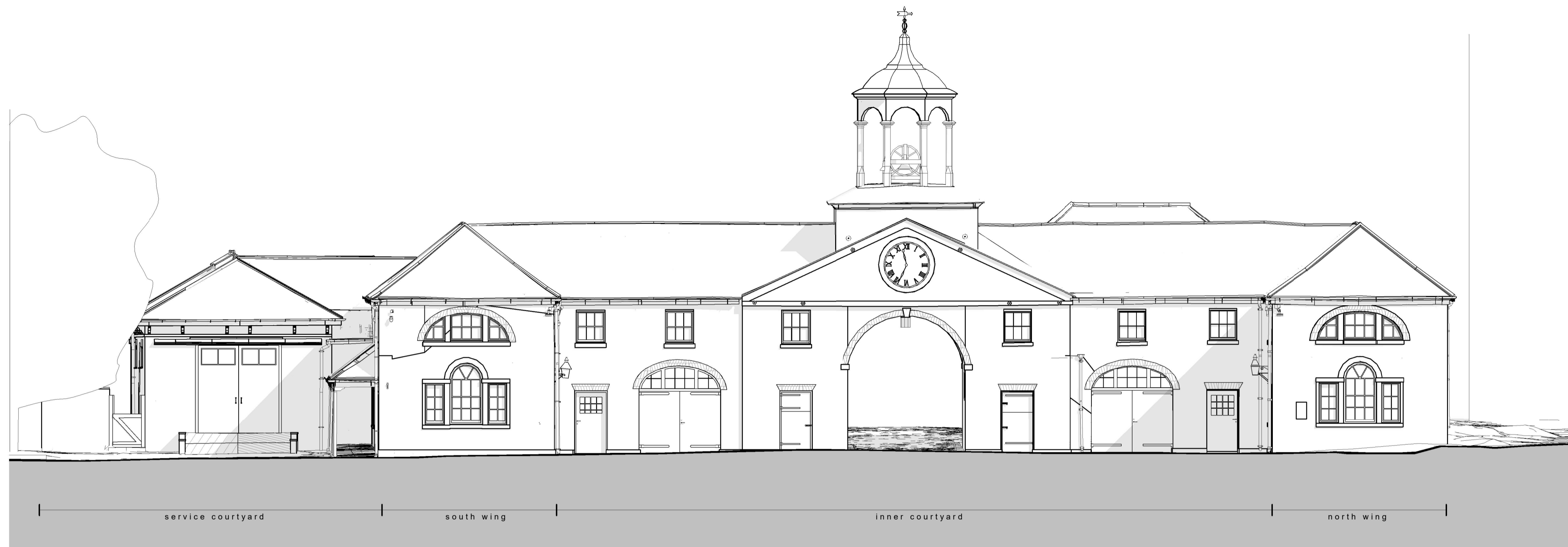
Elevation A - Existing 1 : 100

Copyright: This drawing is the sole copyright of brown + company any reproduction in any form is forbidden unless permission is granted in writing. Do not scale from this drawing, any discrepancies on site should be brought to the attention of brown + company Work and materials must comply with the current building regulations and any relevant codes of practice, and must be read in conjunction with the building specification and any other consultants or sub-contractor information.