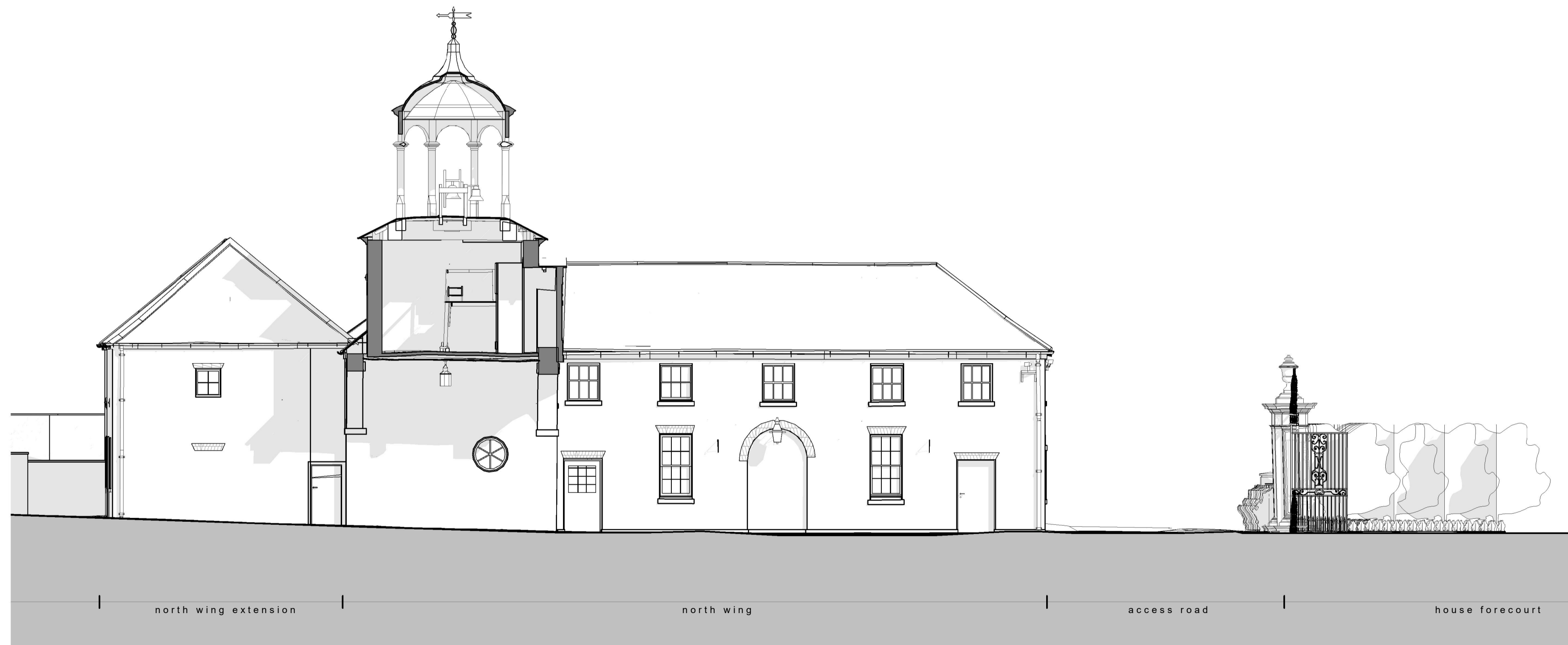
Elevation B - Existing 1 : 100