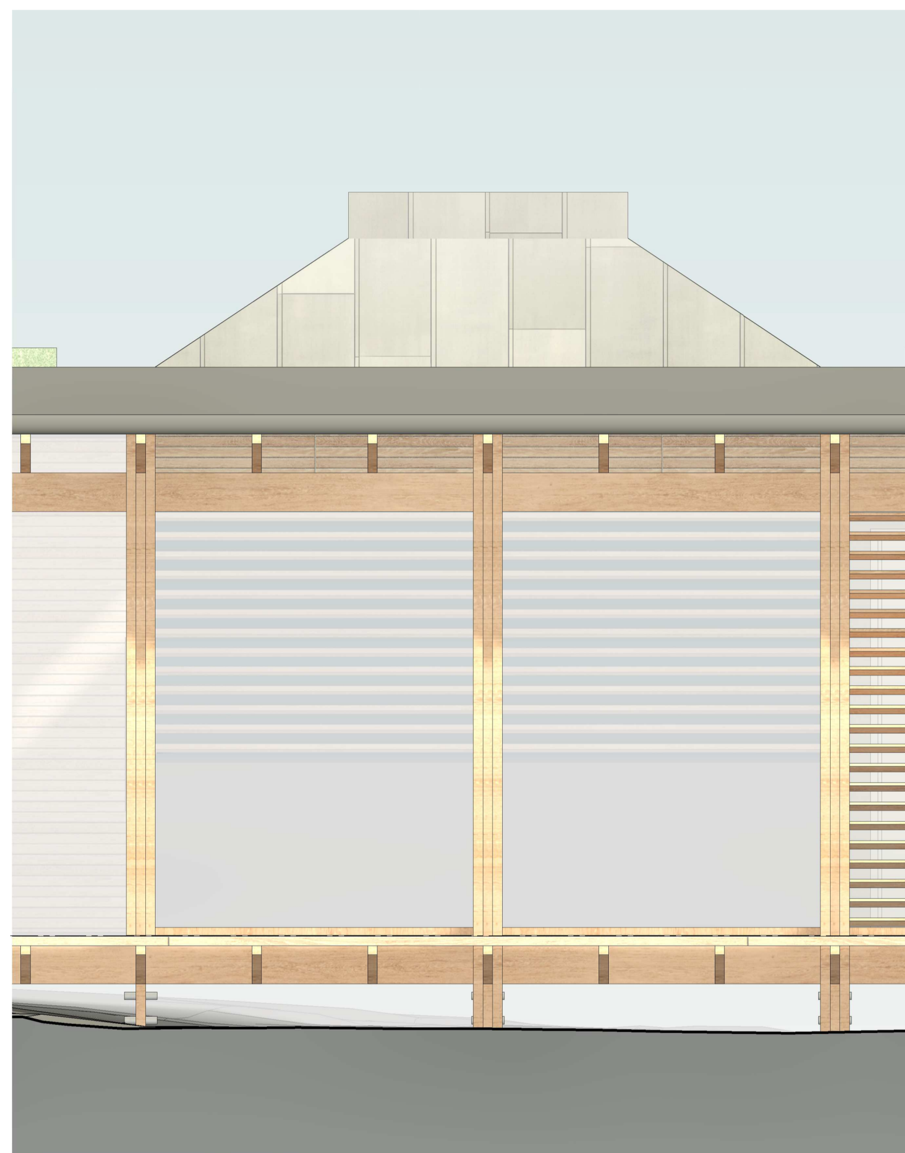
Elevation B - Proposed - Callout 1 1 : 20