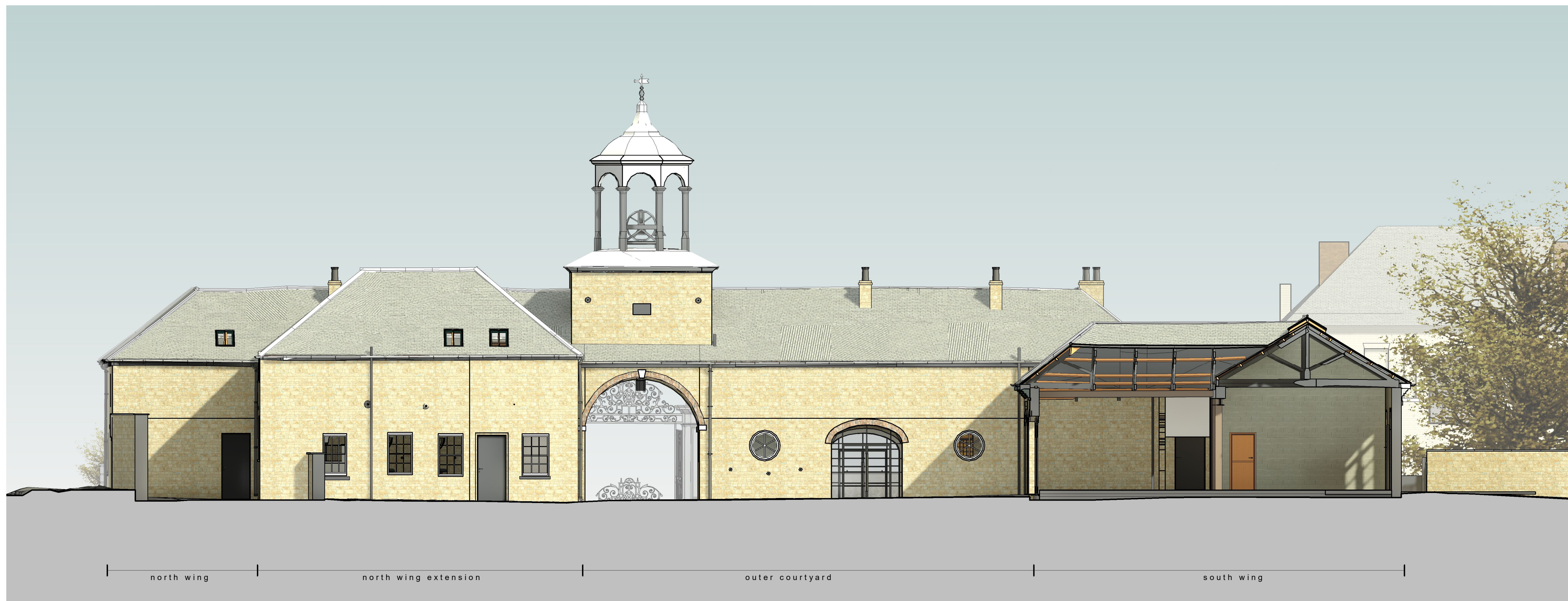
Elevation D - Proposed Coloured 1 : 100

All cementitious mortar to external walls to be removed and replaced with lime based mortar.