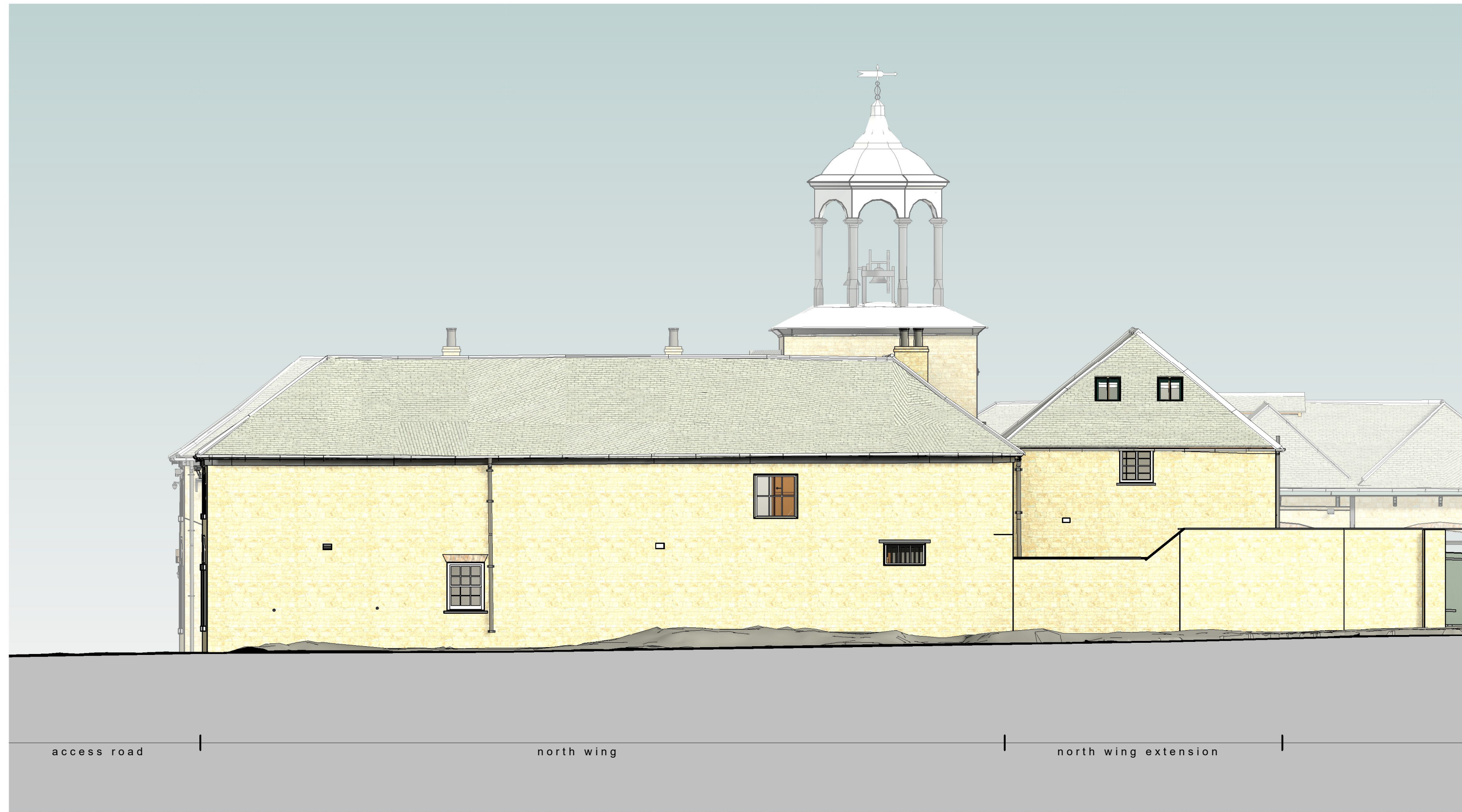
Elevation C - Proposed Coloured 1 : 100