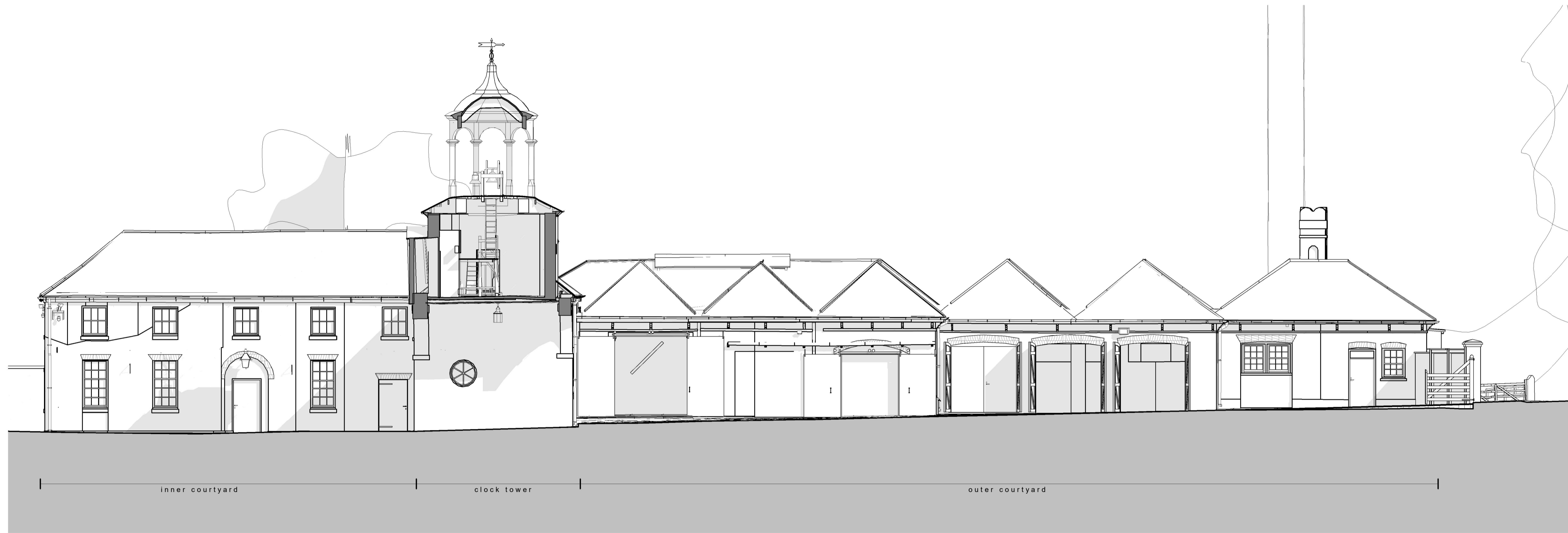
Key Plan 1 : 500

Copyright: This drawing is the sole copyright of brown + company any reproduction in any form is forbidden unless permission is granted in writing. Do not scale from this drawing, any discrepancies on site should be brought to the attention of brown + company Work and materials must comply with the current building regulations and any relevant codes of practice, and must be read in conjunction with the building specification and any other consultants or sub-contractor information.