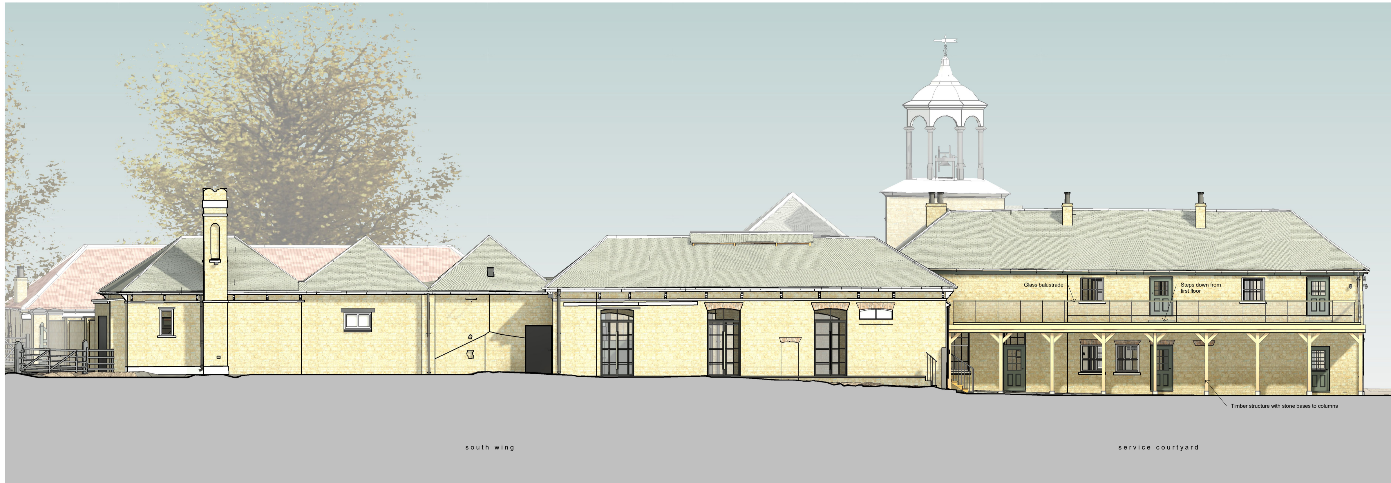
Elevation G - Proposed Coloured