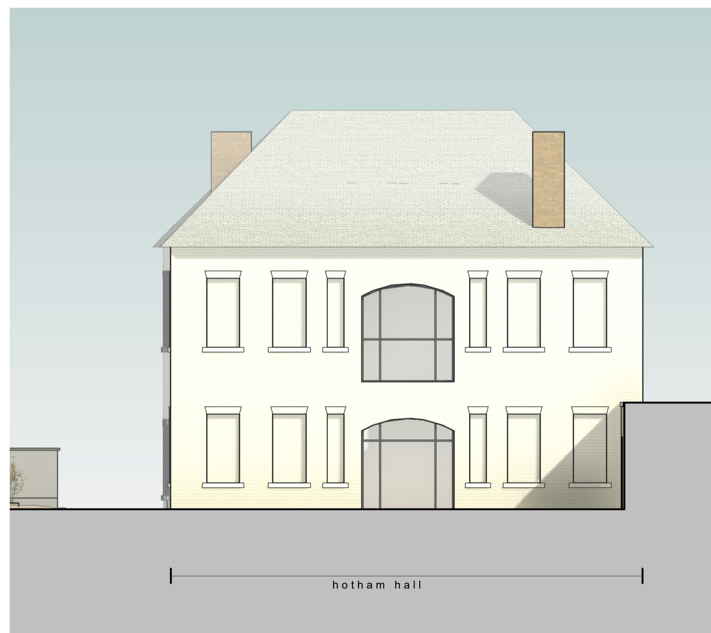
Elevation H - Proposed Coloured

All cementitious mortar to external walls to be removed and replaced with lime based mortar.