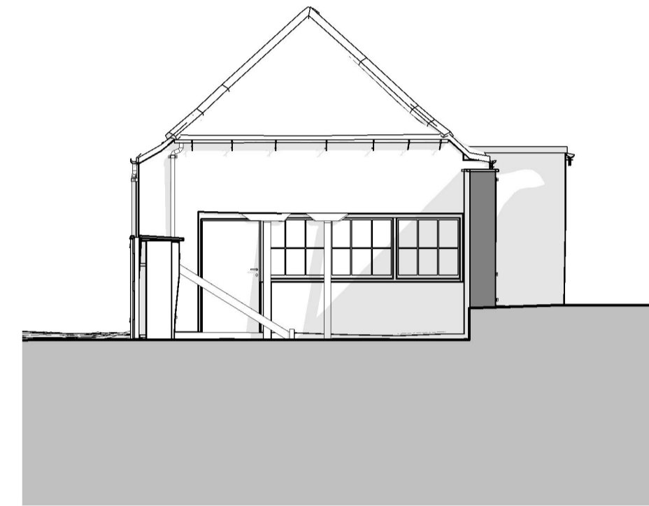
Elevation K - Existing 1 : 100