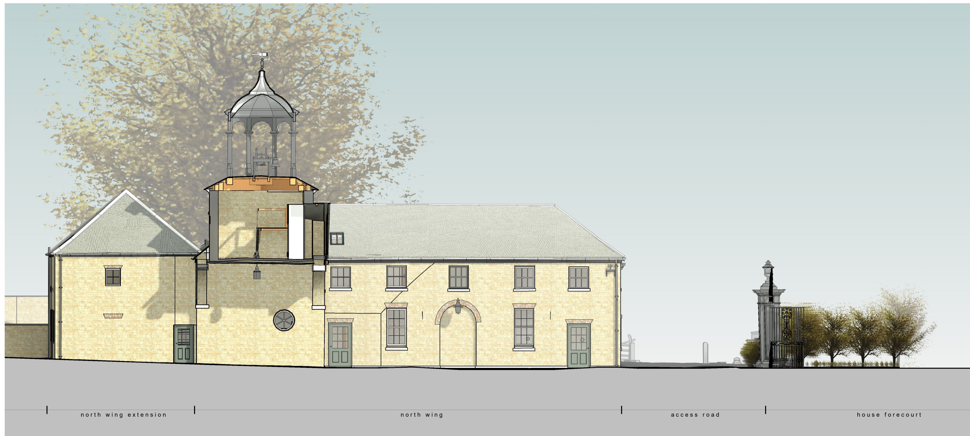
Elevation B - Proposed Coloured