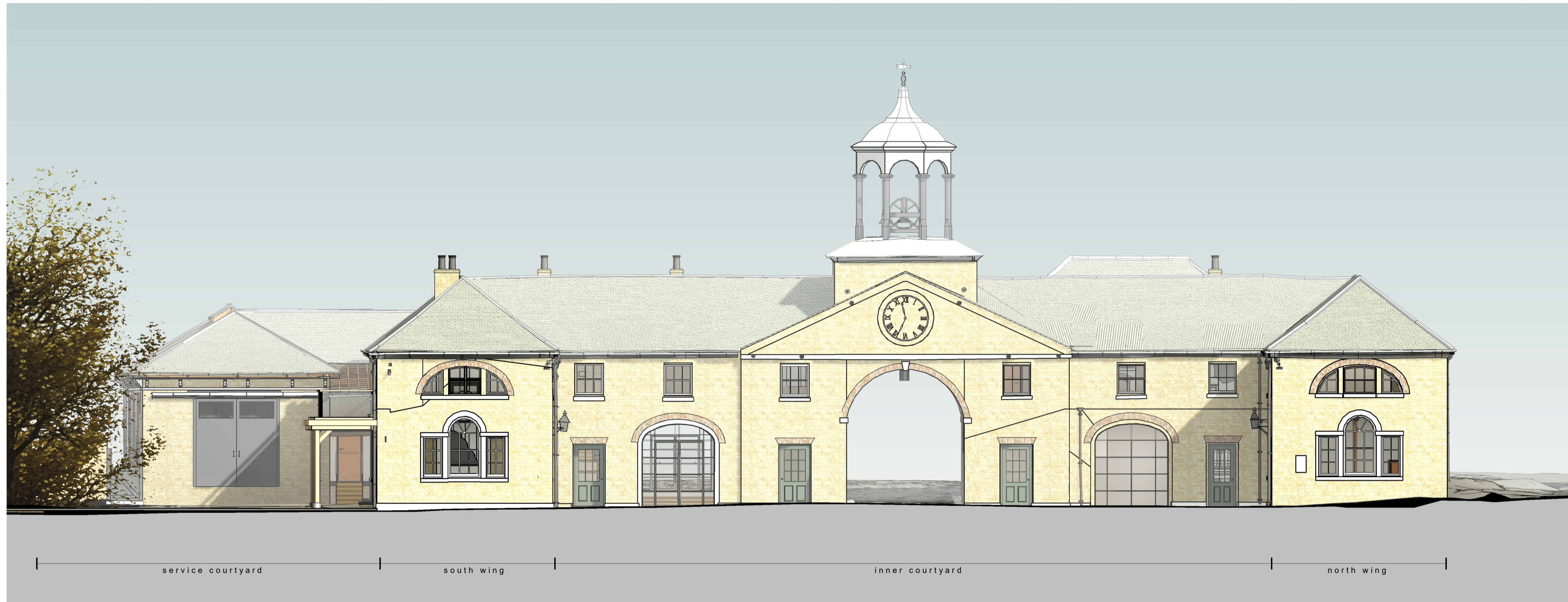
Elevation A - Proposed Coloured

Copyright: This drawing is the sole copyright of brown + company any reproduction in any form is forbidden unless permission is granted in writing. Do not scale from this drawing, any discrepancies on site should be brought to the attention of brown + company Work and materials must comply with the current building regulations and any relevant codes of practice, and must be read in conjunction with the building specification and any other consultants or sub-contractor information.