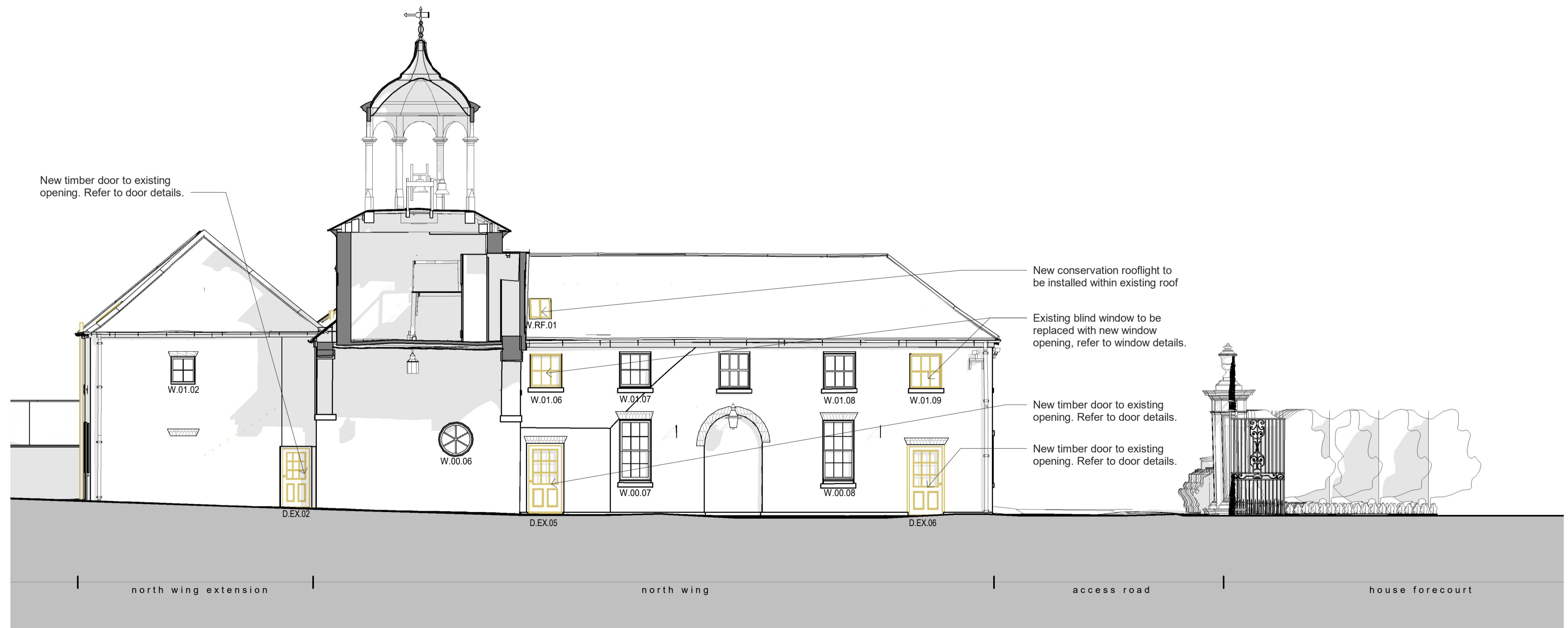
Elevation B - Proposed Annotated 1 : 100