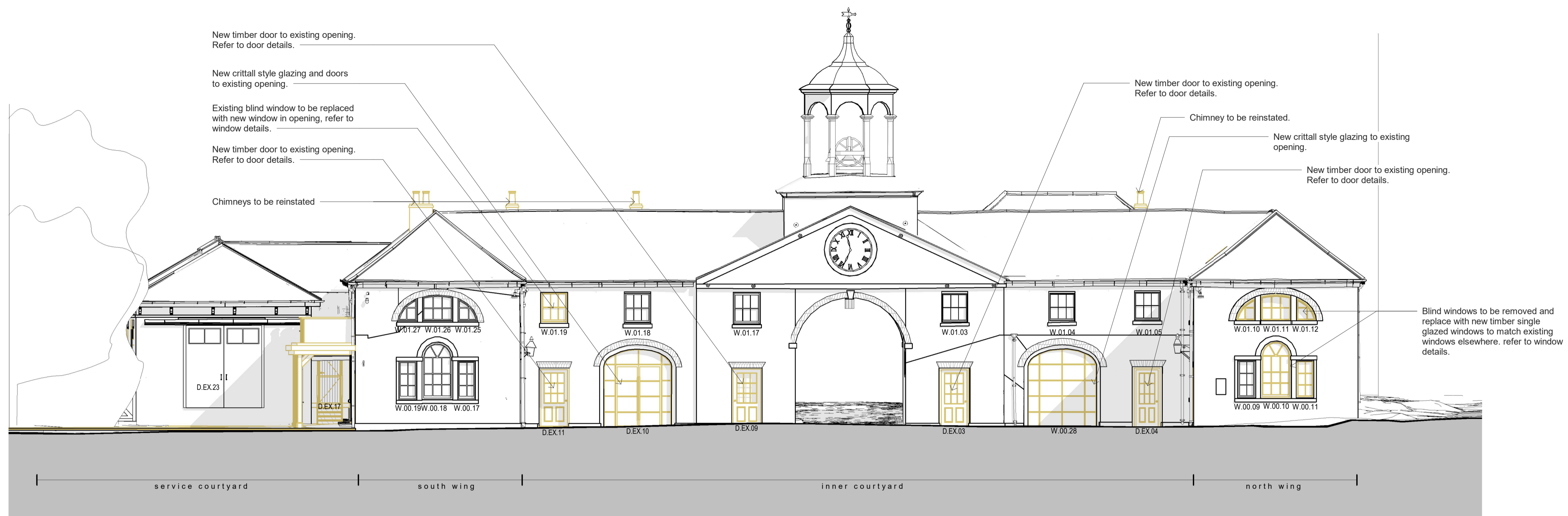
Elevation A - Proposed Annotated 1 : 100