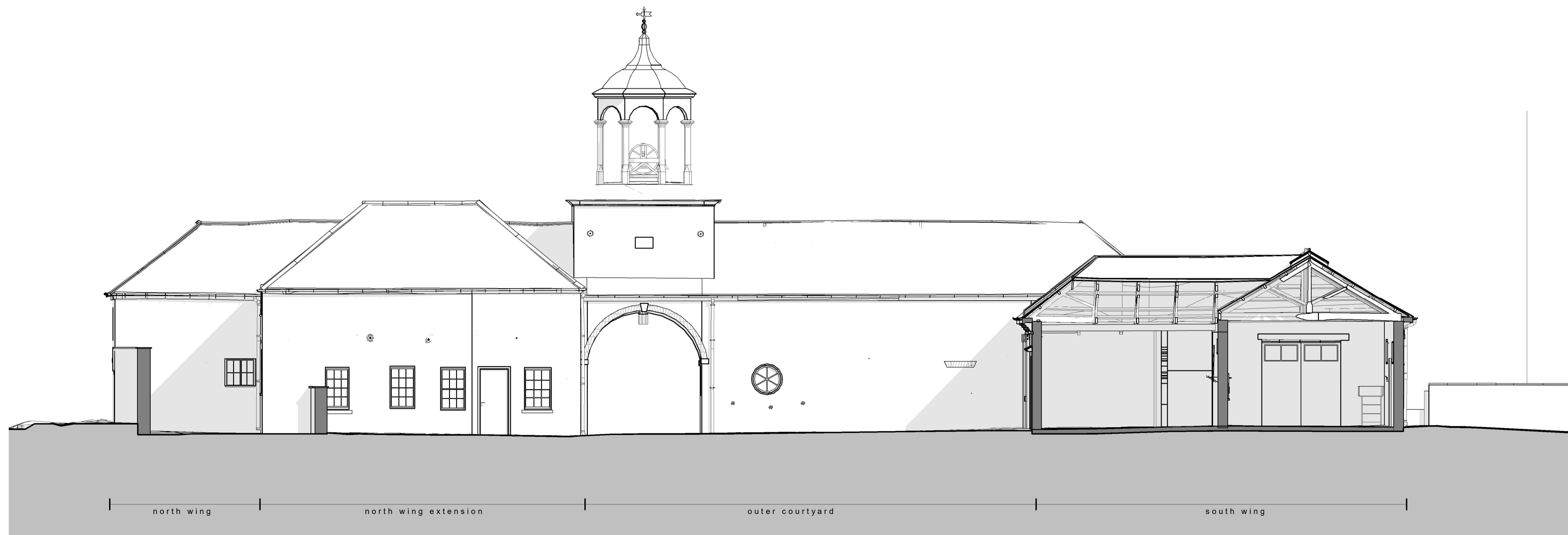
Elevation D - Existing 1 : 100