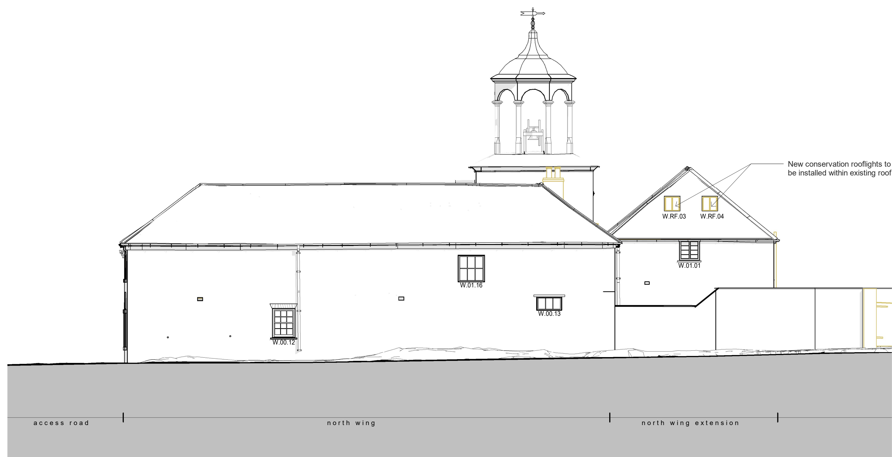
Elevation C - Proposed Annotated 1 : 100