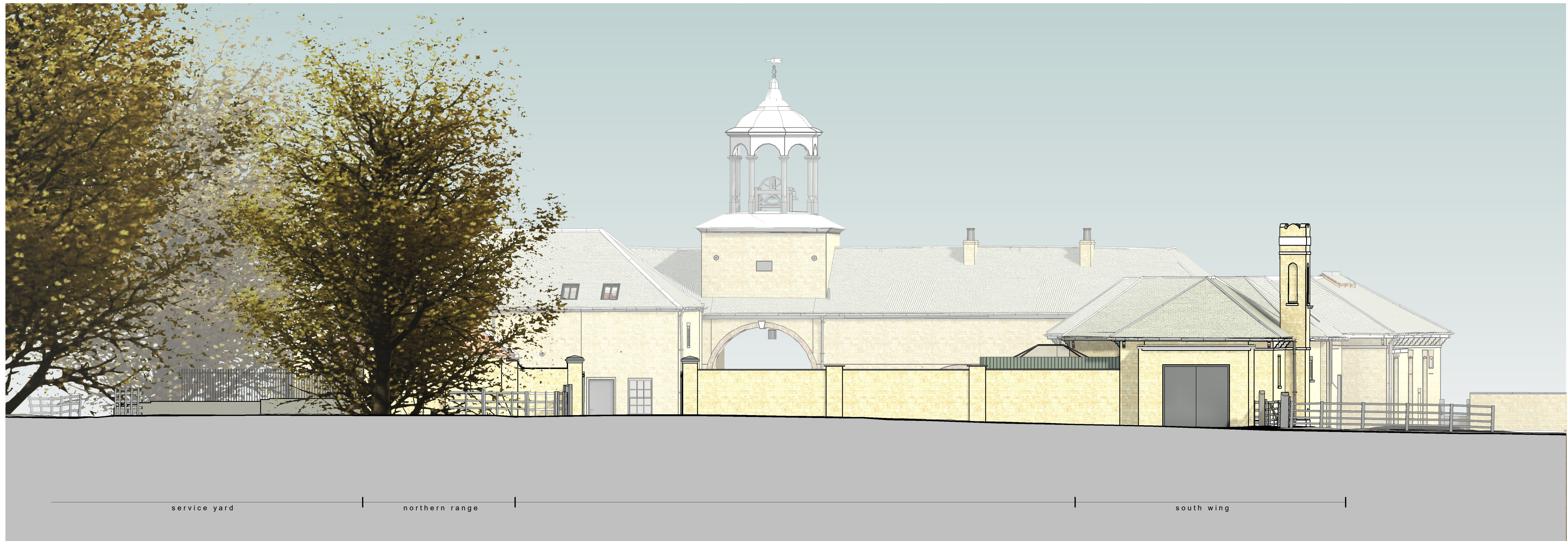
Elevation F - Proposed Coloured

All cementitious mortar to external walls to be removed and replaced with lime based mortar.