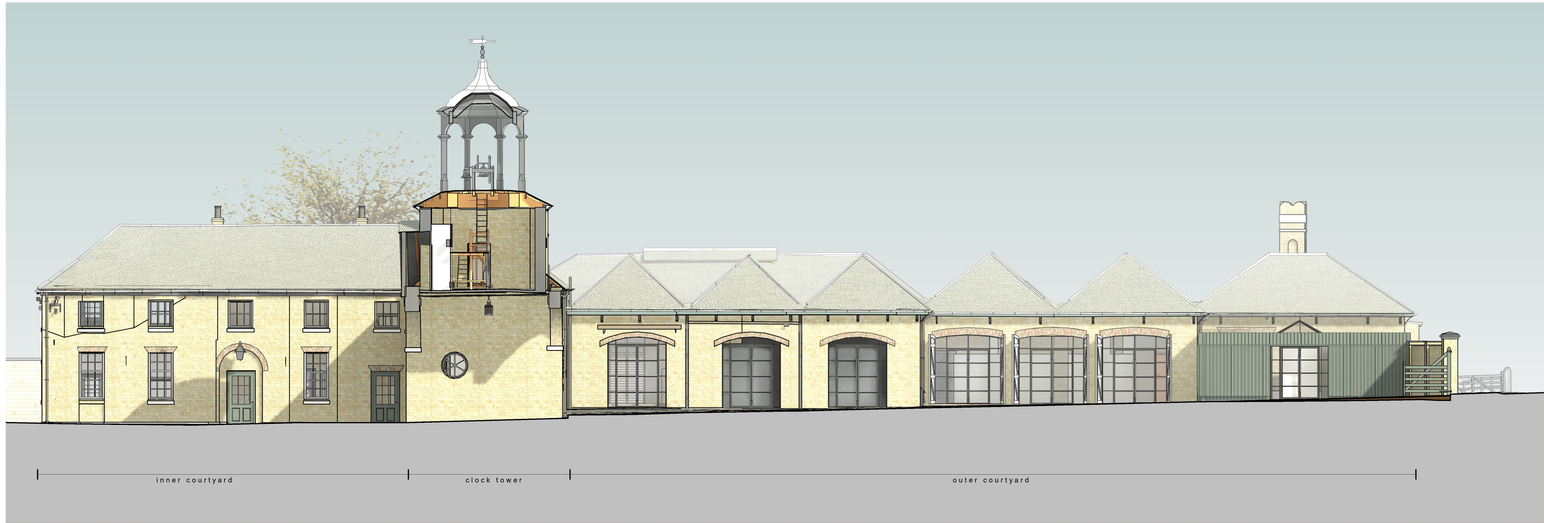
Elevation E - Proposed Coloured

Copyright: This drawing is the sole copyright of brown + company any reproduction in any form is forbidden unless permission is granted in writing. Do not scale from this drawing, any discrepancies on site should be brought to the attention of brown + company Work and materials must comply with the current building regulations and any relevant codes of practice, and must be read in conjunction with the building specification and any other consultants or sub-contractor information.