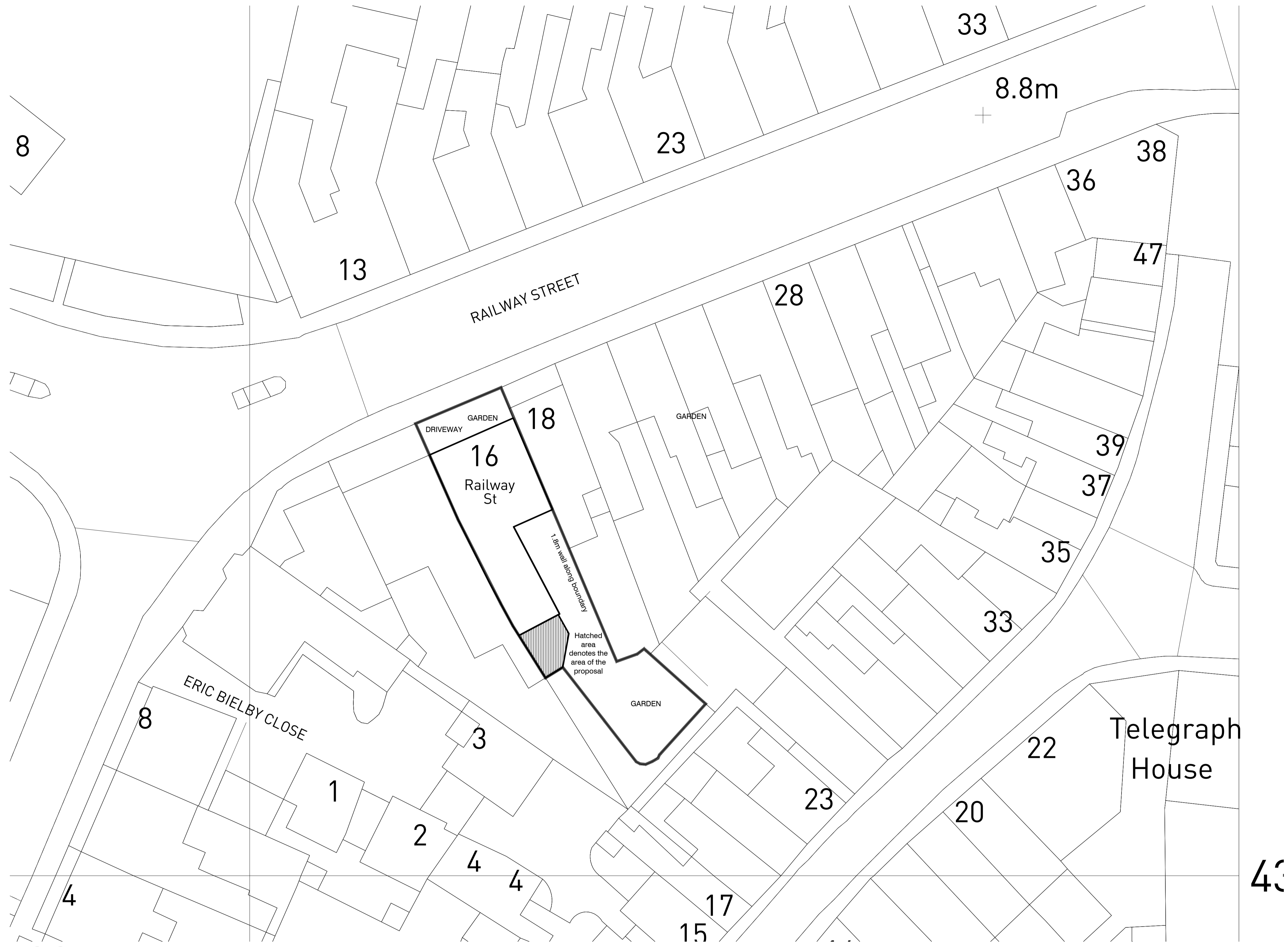
02 PROPOSED SITE PLAN Scale: 1:200 @ A1