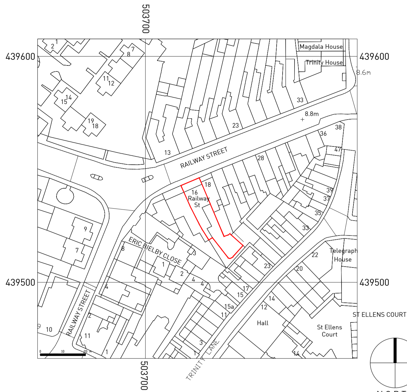
01 LOCATION PLAN Scale: 1:1000 @ A1