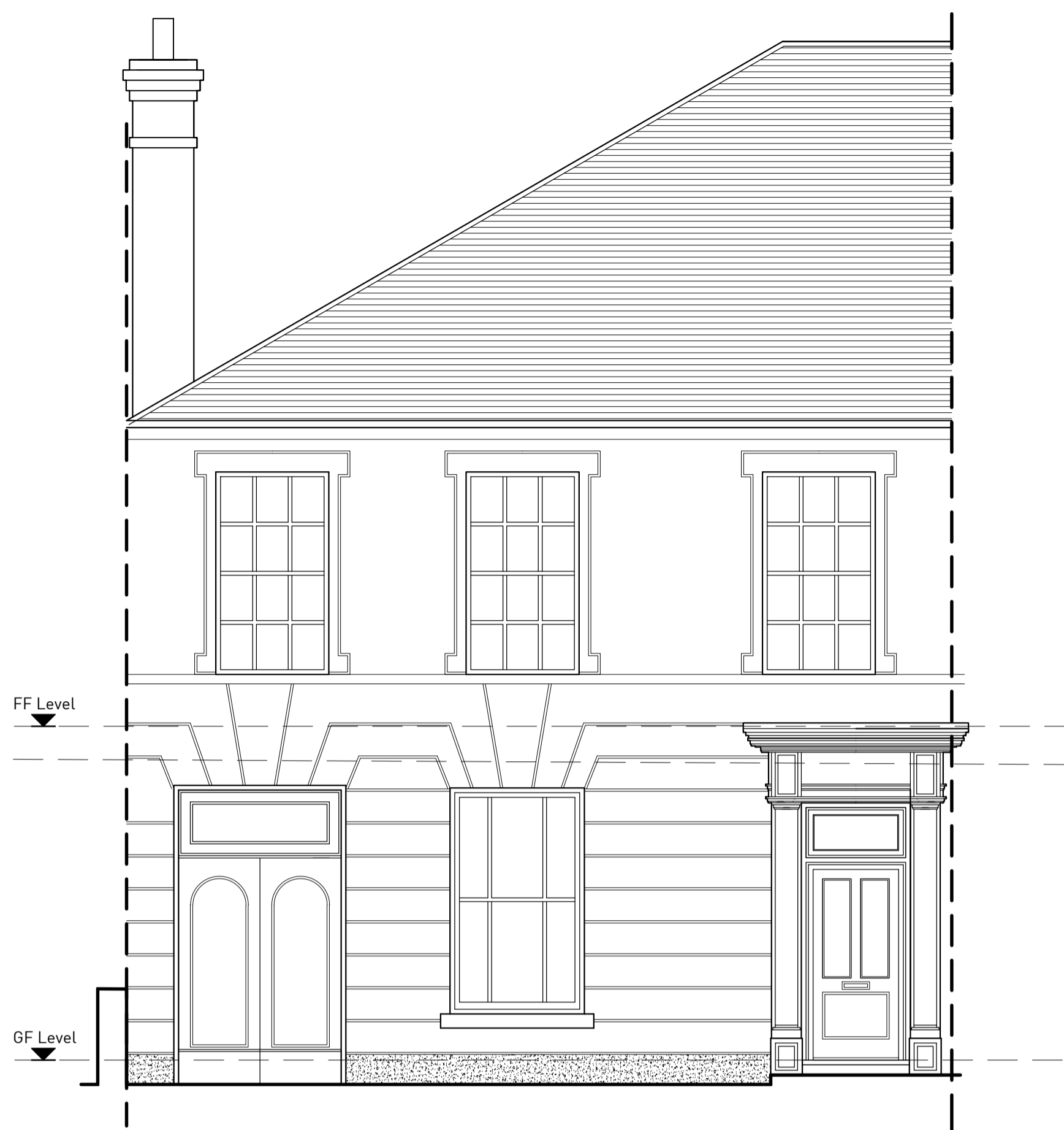
01 EXISTING FRONT ELEVATION Scale: 1:50 @ A1