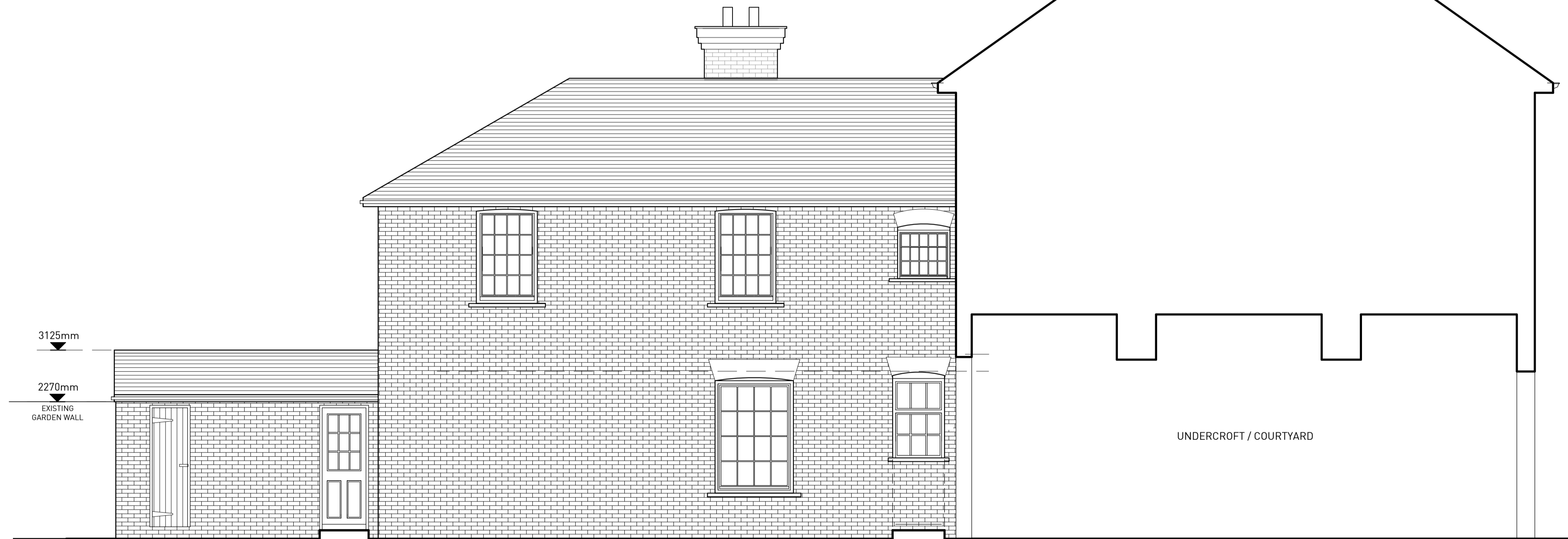
02 EXISTING SIDE ELEVATION Scale: 1:50 @ A1