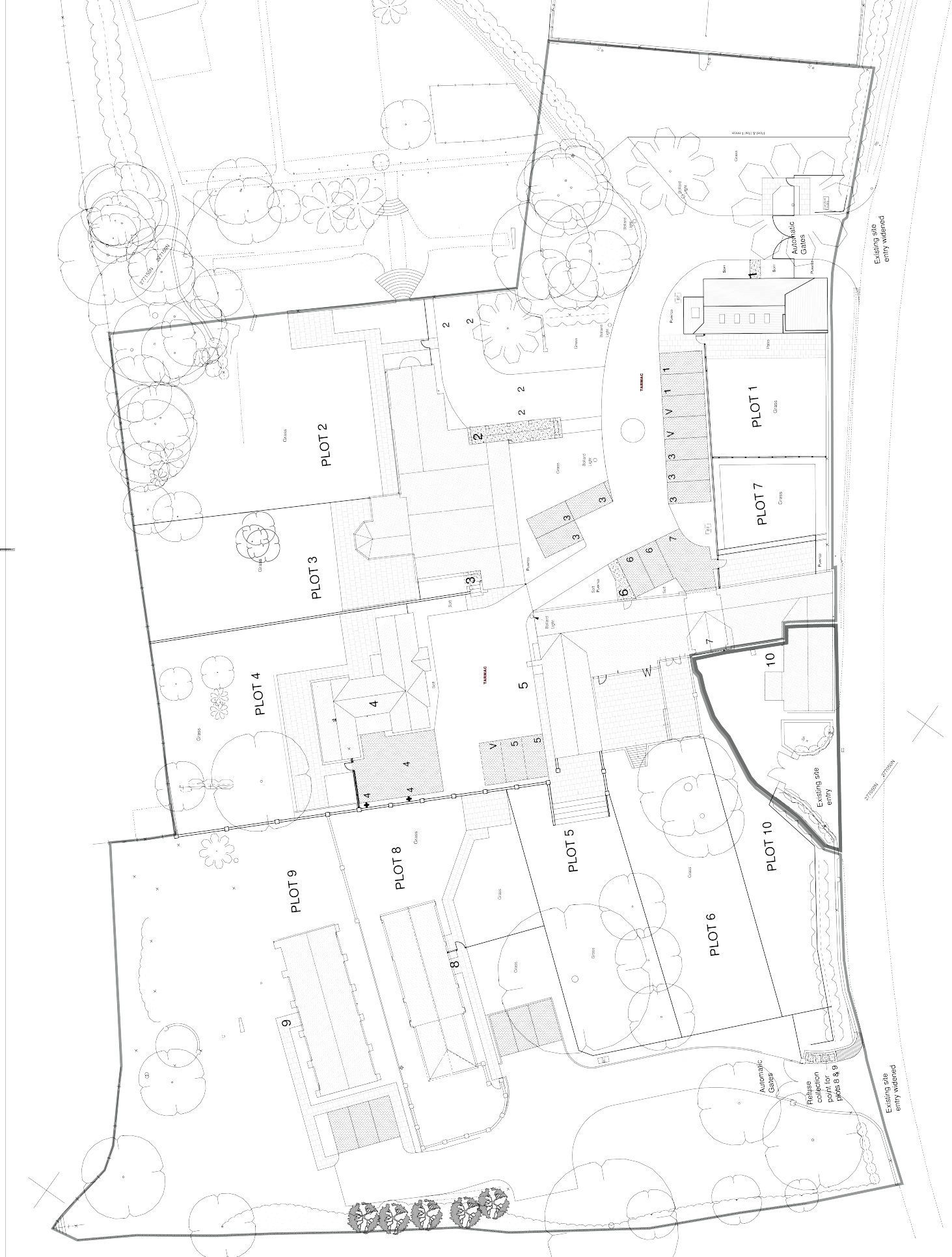
SITE LAYOUT - SCALE 1:200 @A1