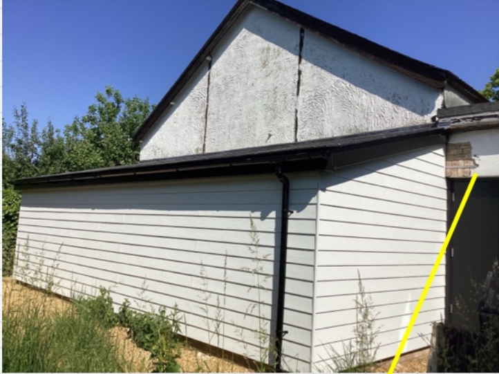
New rear extension