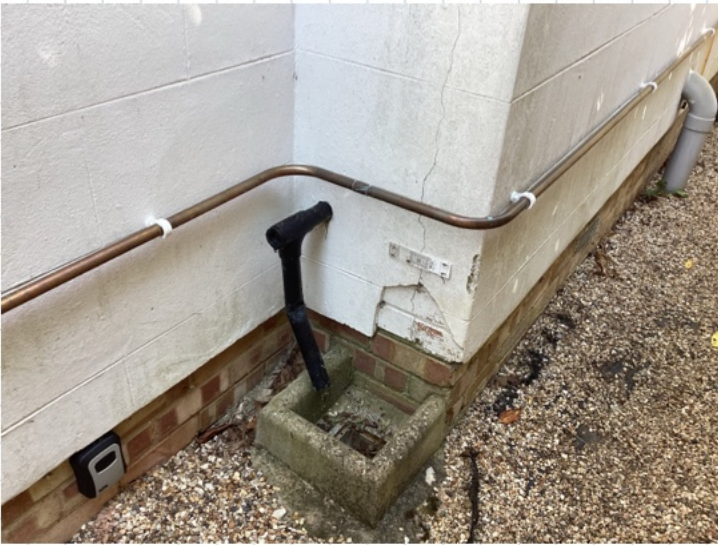
Crack to left side