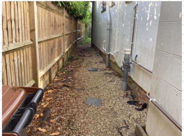
View of left side