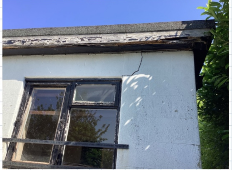
Damage to rear of left side