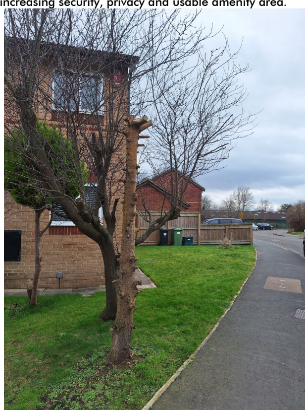
The side garden area at 2 Jeffrey Court

2 Jeffrey Court is an end of terrace property, built in the 1990s as part of a larger estate. The property is on the corner of Jeffrey Court and Lintern Crescent. The property has a small enclosed rear garden, as well as a significant area of open garden to the side and front, which is open to the public domain. To the south of the property is a row of garages, and an existing portion of 1.8m high close boarded fence which encloses the southern boundary of the garden. The applicant has lived at the property for several years, and wishes to enclose the remaining part of garden to the side (west) of his home, increasing security, privacy and usable amenity area.