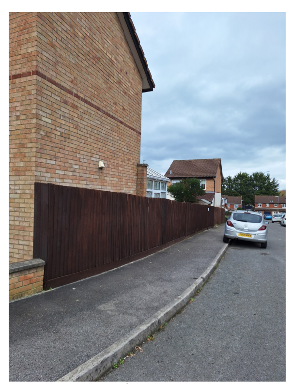
Closed boarded fence boundary at No 20&15